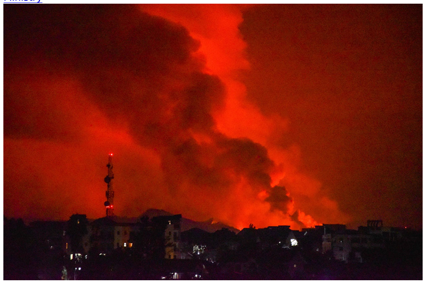
Smoke rises from the volcanic eruption of Mount Nyiragongo near Goma, Congo, May 22.