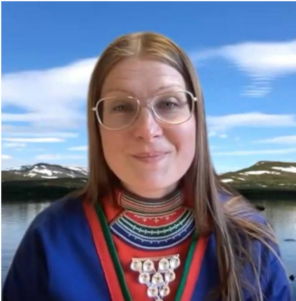
Åsa Larsson Blind, president of the Saami Council, pictured June 9 during a webinar opposing solar geoengineering technology