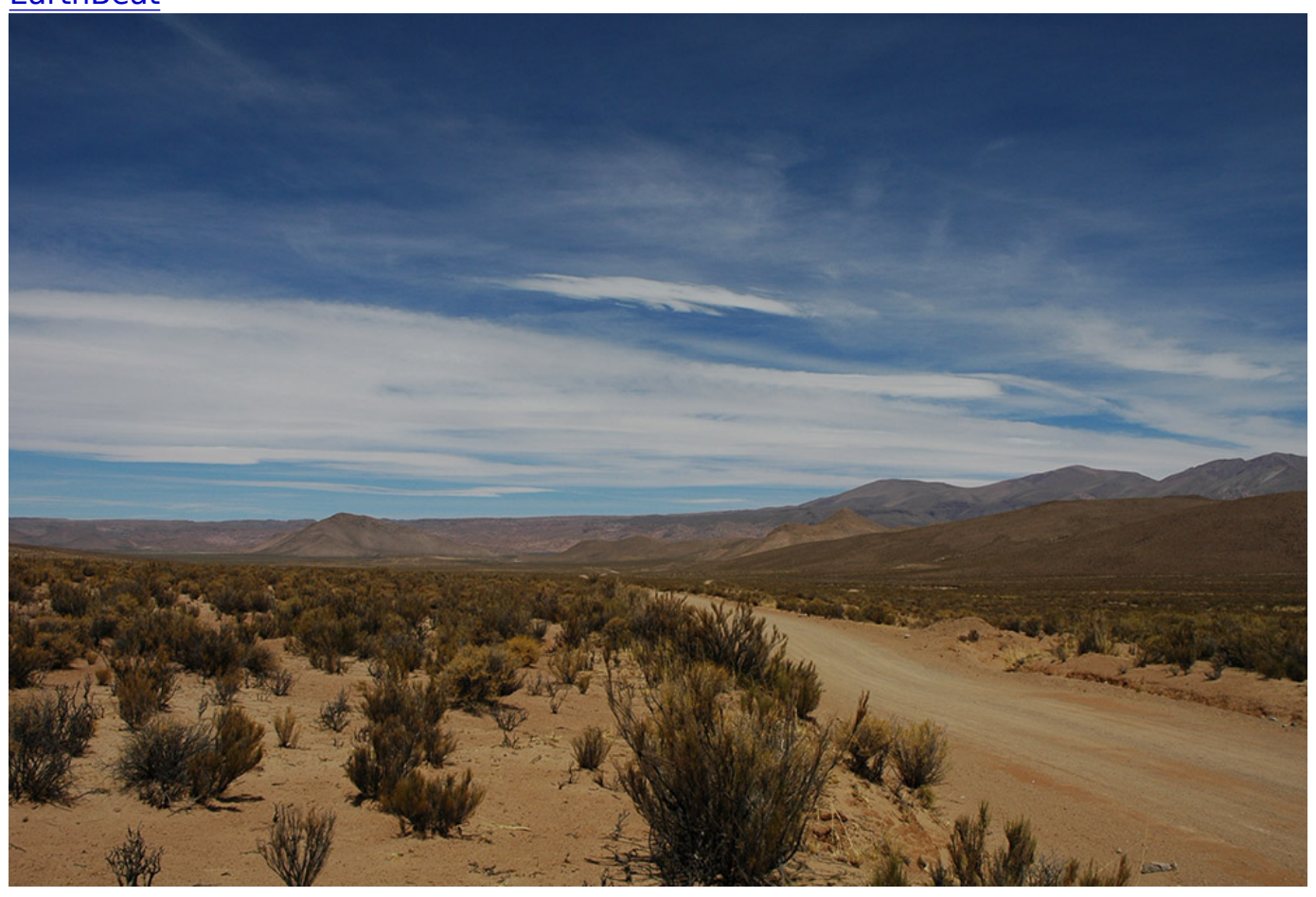
A Gran Chaco landscape in Jujuy Province, Argentina