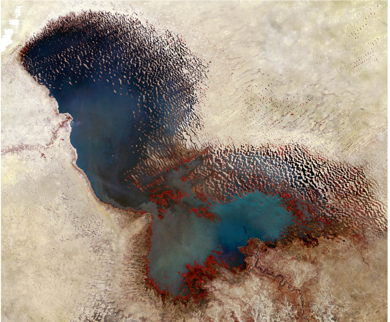
• Lake Chad in 1973: Africa's Lake Chad was once an important source of fish and of water for farming for people in Chad, Cameroon and Nigeria.