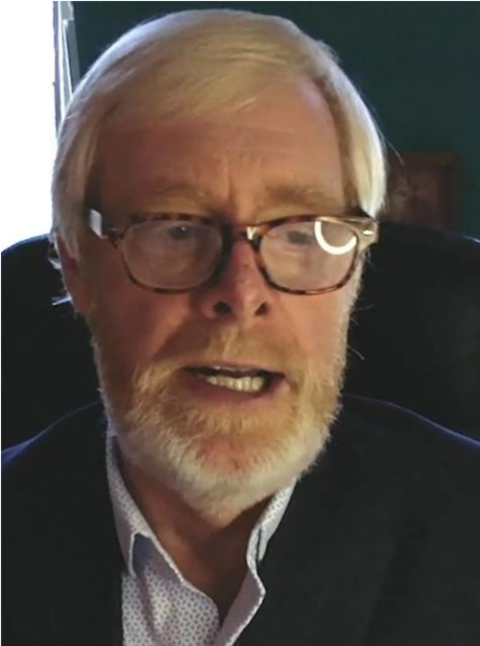
L. Brent Bozell III, speaking during the Napa Institute's summer conference

The veteran conservative political activist, L. Brent Bozell III, who signed a letter in December that declared Trump to be "the lawful winner of the presidential election" called Biden "the president of the most radical leftist ideology in history."