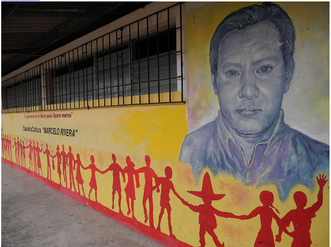
A mural of the late water defender Marcelo Rivera on the Casa de Cultura in San Isidro, Cabañas, El Salvador