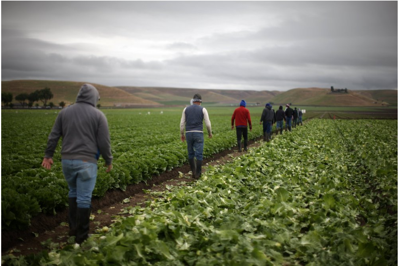
Migrant farmworkers with H-2A visas harvest romaine lettuce in King City, California, April 17, 2017.