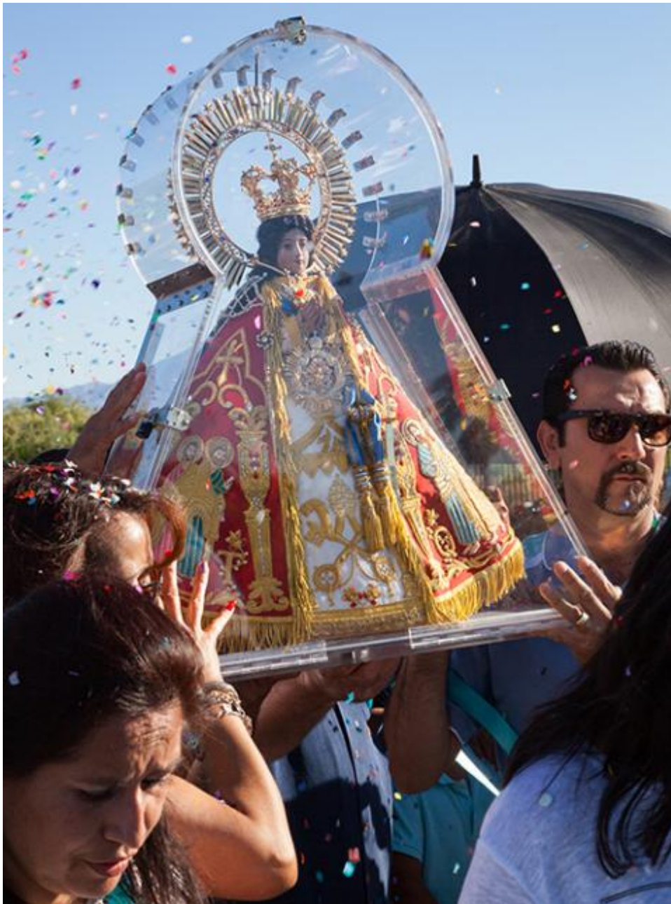
Photo from Noé Montes, an artist who comes from a family of migrant farmworkers, taken in Mecca, California, during an annual visit of La Virgen de Zapopan to the United States in 2015. (Courtesy of Noé Montes)

Rangel said that at the beginning of the pandemic many farmworkers were not given masks or their employers attempted to charge them for personal protective equipment. Others reported that workers were required to bring their own toilet paper to the fields.