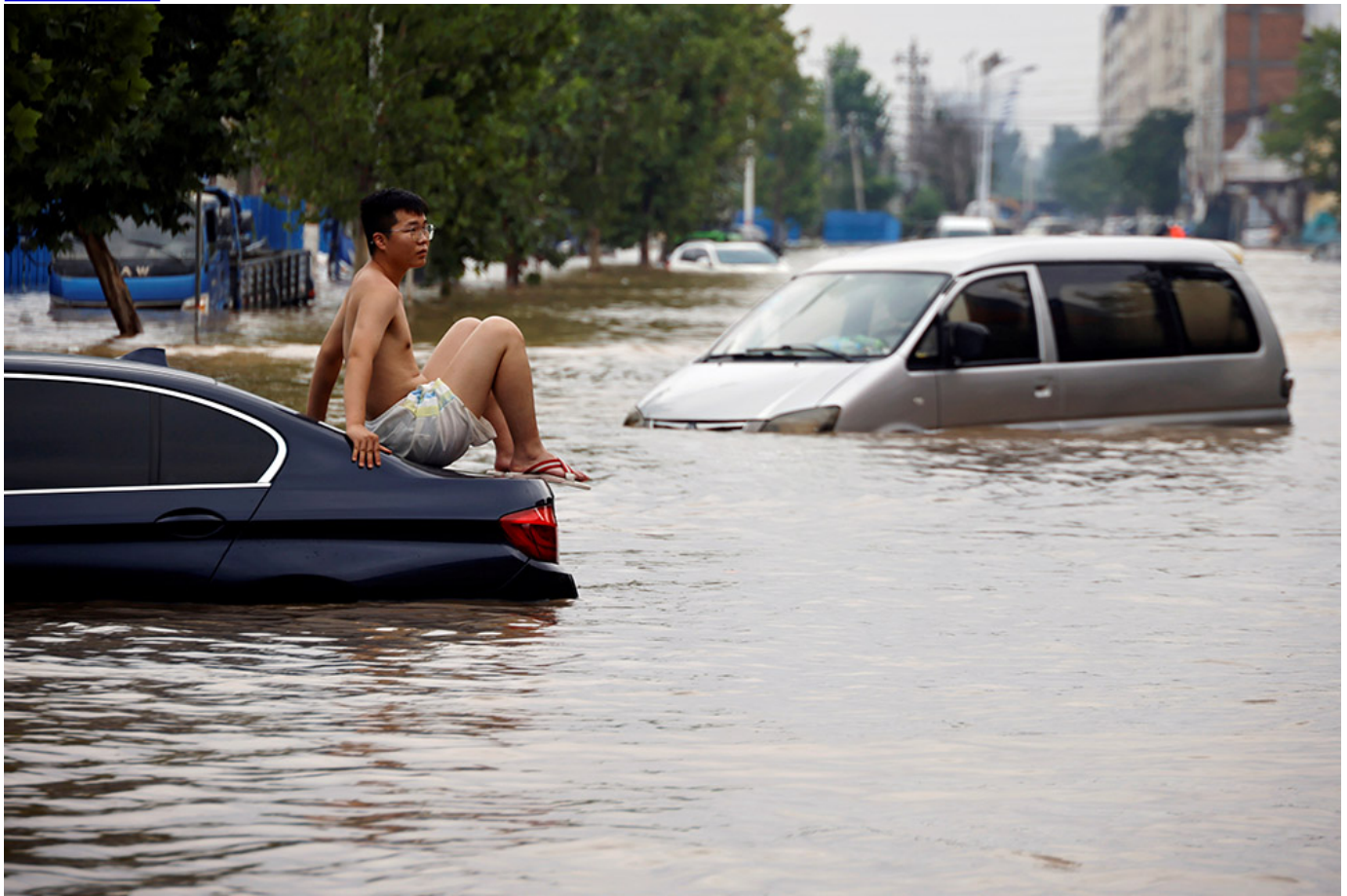
A man sits on a stranded vehicle on a flooded road following heavy rainfall in Zhengzhou, China, July 22.