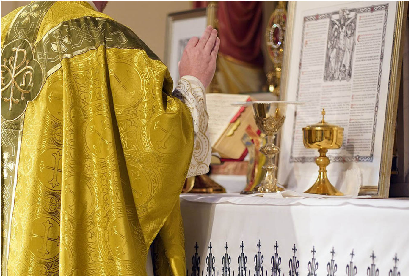
A priest prays during a traditional Latin Mass at St. Josaphat Church in the Queens borough of New York City.