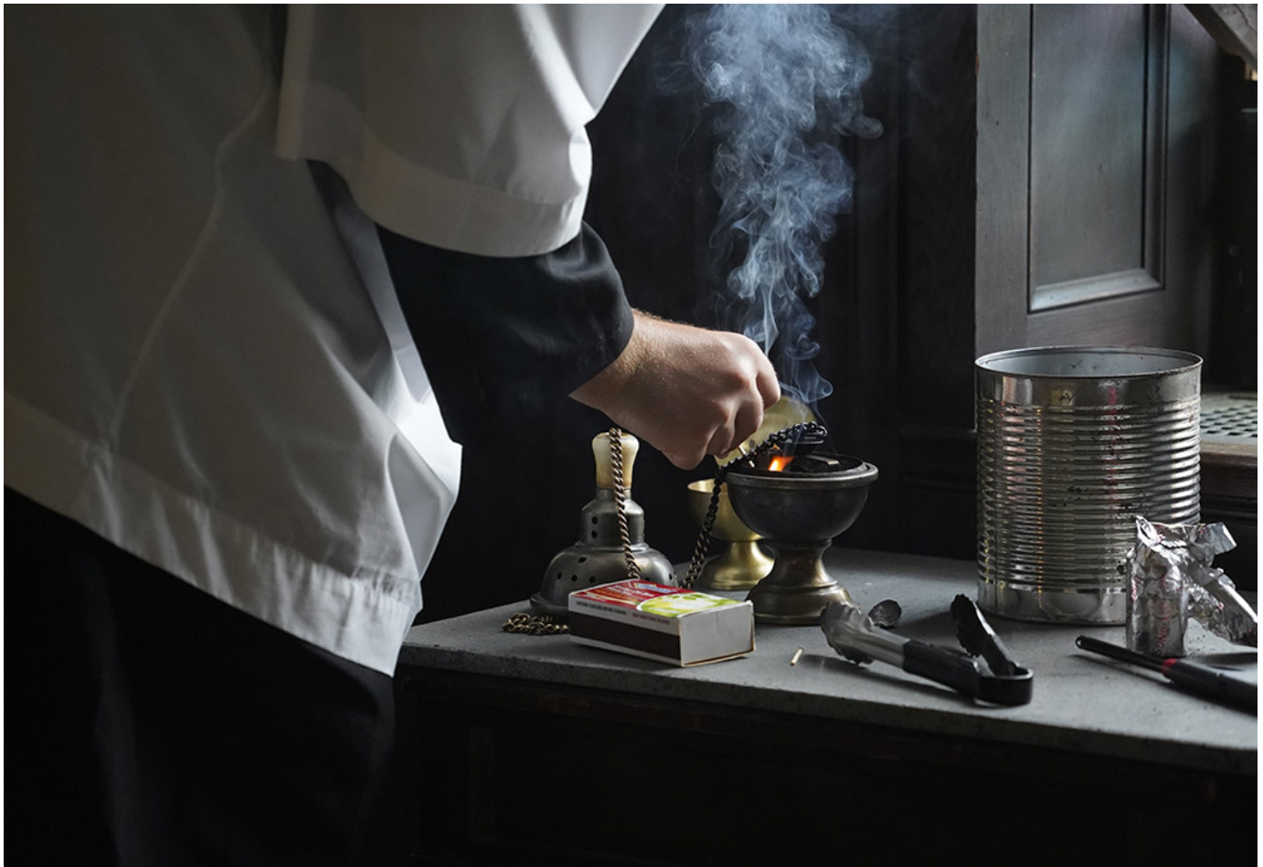
An altar server prepares a censer for use during a traditional Latin Mass at Immaculate Conception Seminary in Huntington, New York.