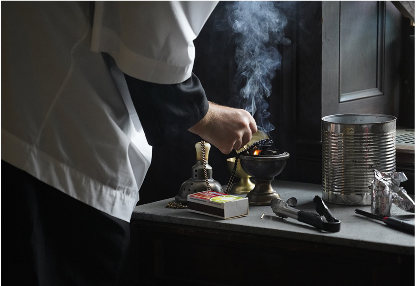
An altar server prepares a censer for use during a traditional Latin Mass at Immaculate Conception Seminary in Huntington, New York.