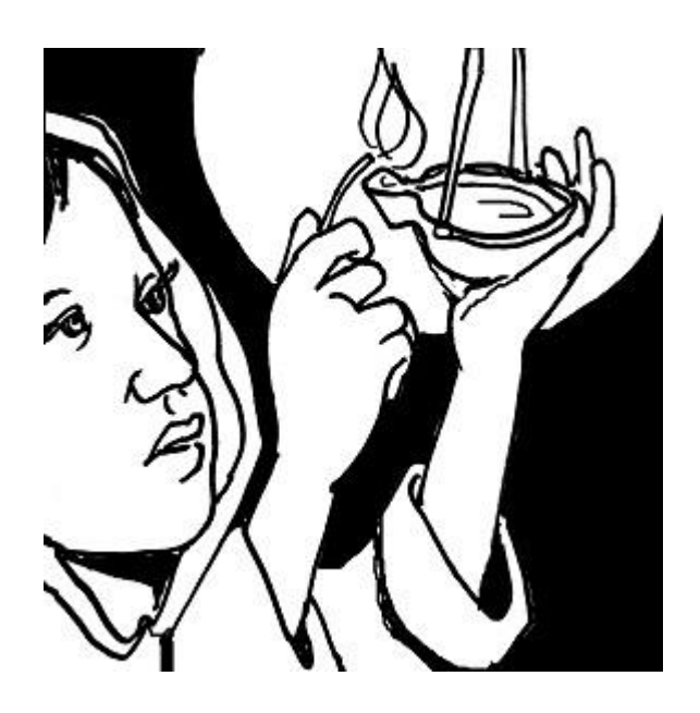
"Who, then, is the faithful and prudent servant?" (Matt 24:45).