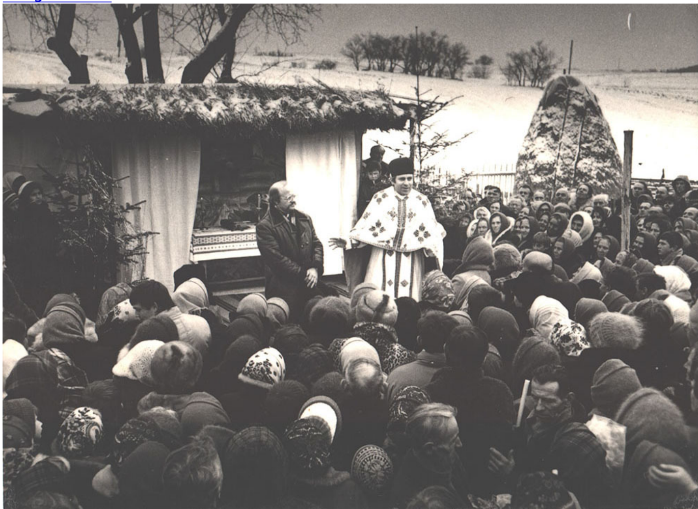
A liturgy of the Ukrainian Greek Catholic Church, held outside in the village Tserkivna, Ivano-Frankivsk region, Ukraine, 1989