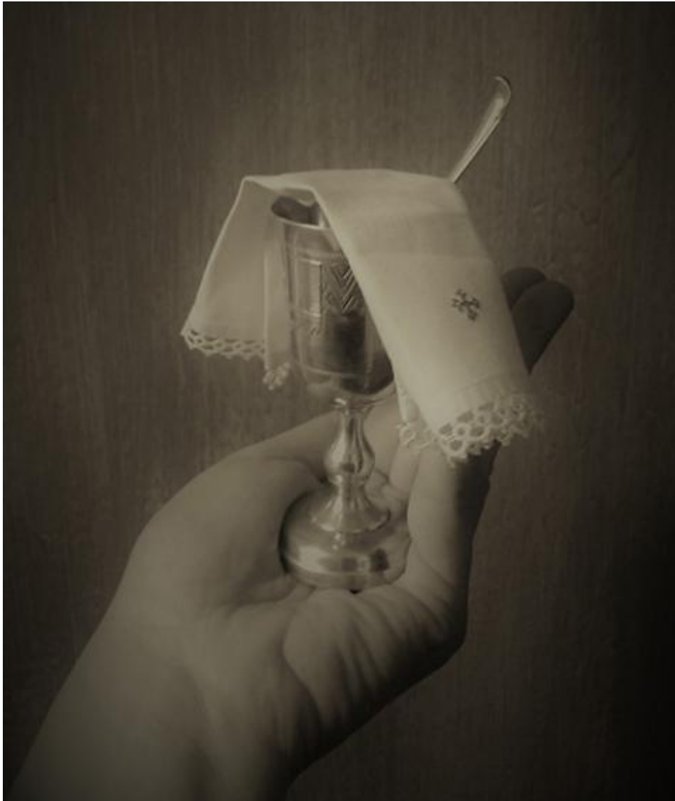
A miniature chalice from the time of the underground Ukrainian Greek Catholic Church

The Basilian Sisters came to Croatia from Ukraine in 1915. In the late 19th and early 20th centuries, thousands of Ukrainians left their homeland in search of a better life. Thanks to Metropolitan Andrey Sheptytsky , priests and nuns followed the exodus to support their people, and the community of Basilian Sisters in Croatia developed and grew.