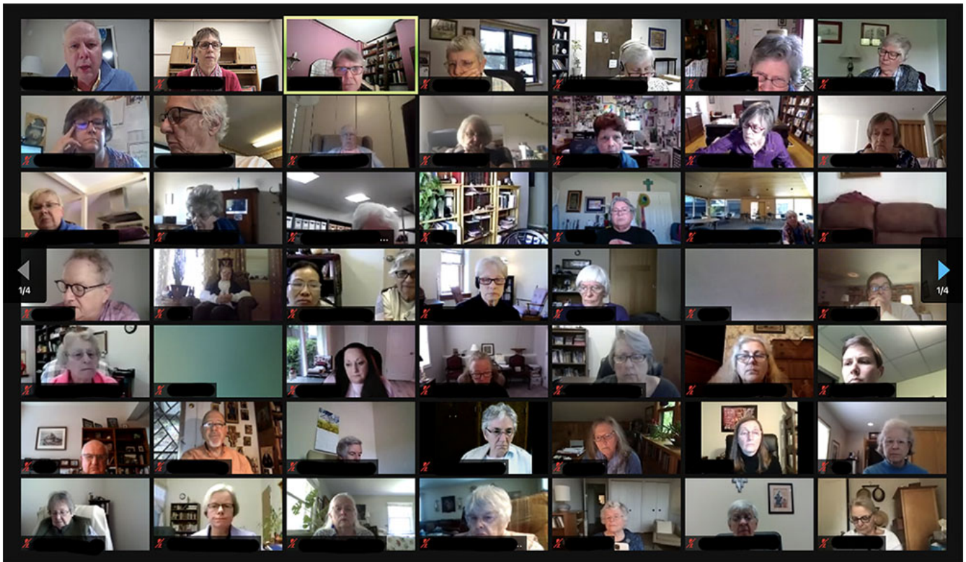
Screenshot of participants in "Being Benedictine in the 21st Century: Spiritual Seekers in Conversation," a recent online gathering seeking to define the essence of Benedictine monastic life

The resounding answer from our fellow Benedictines is, Yes, we were made for a time such as this.