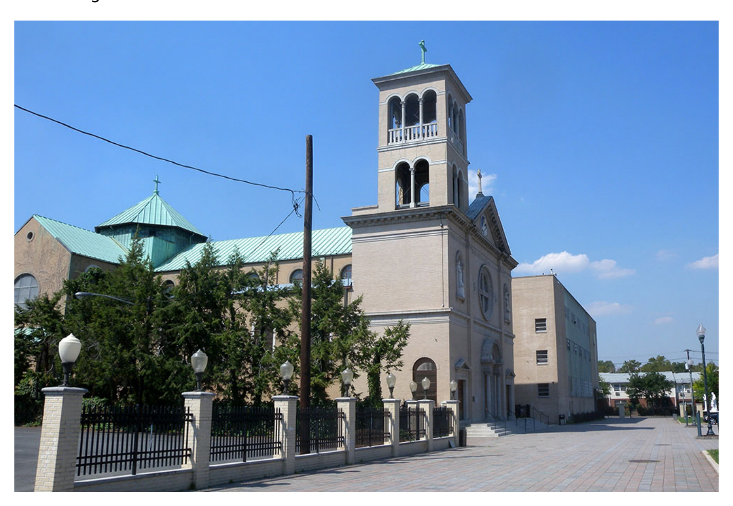
St. Lucy's Church in Newark, New Jersey