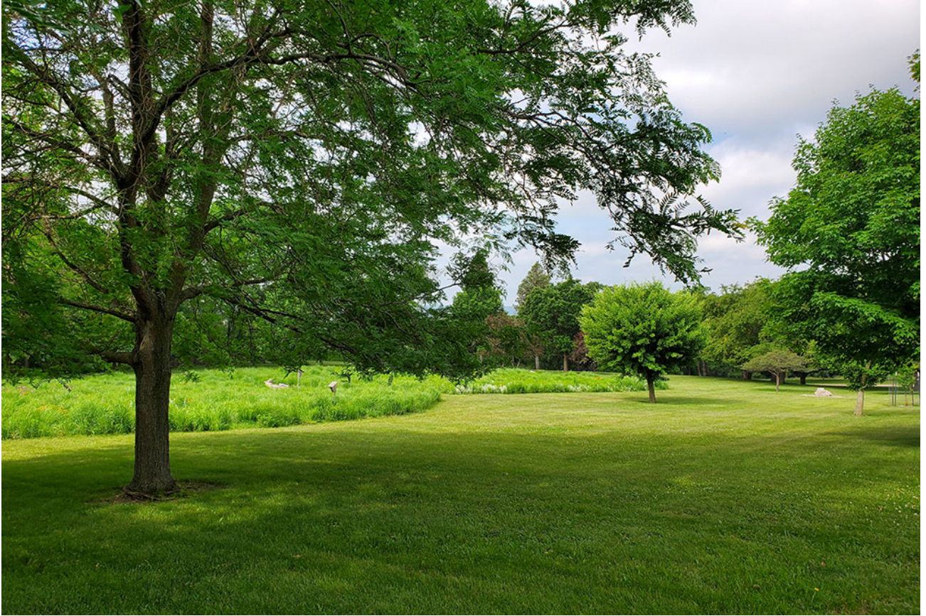
The Sisters of St. Francis decided to protect the land for its natural beauty and spiritual significance, and as a symbol of conservation in the growing Rochester, Minnesota, area.