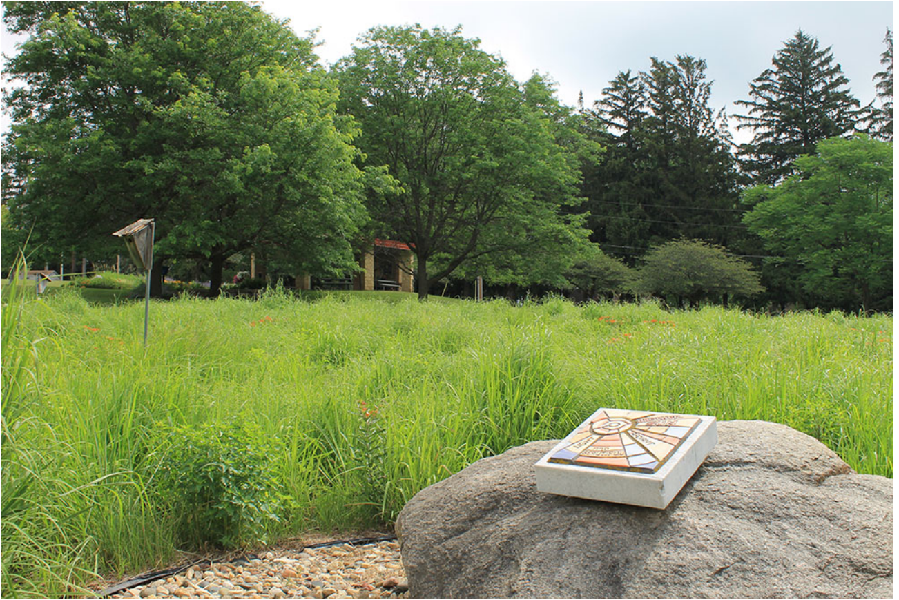
A tablet rests on a rock in a meadow that is part of the conservation easement of the Sisters of St. Francis of Rochester, Minnesota.