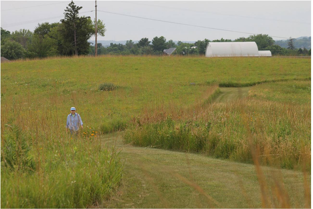
A Franciscan sister walks the prairielands near the motherhouse of the Sisters of St. Francis in Dubuque, Iowa. The congregation has placed 68 acres of the property in a conservation easement.