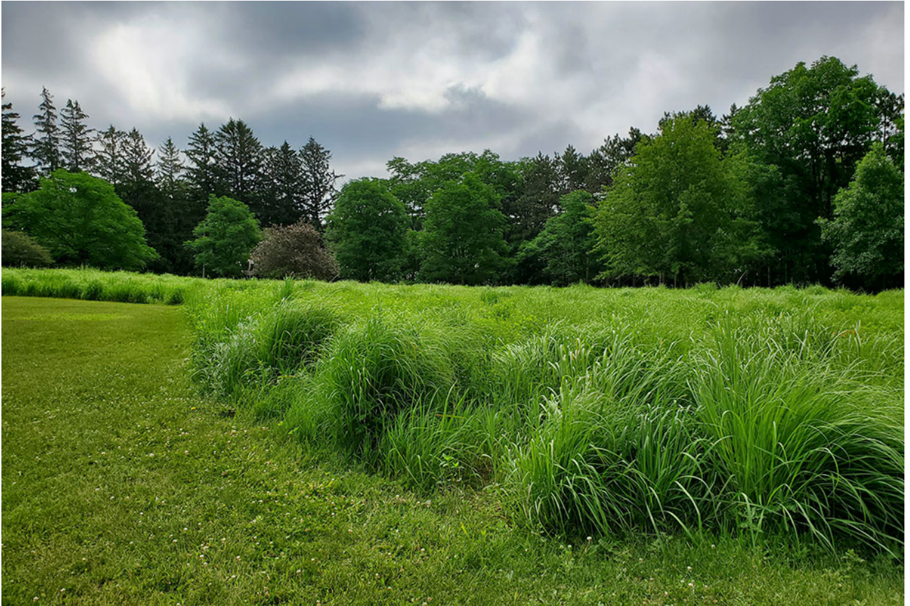
The Sisters of St. Francis of Rochester, Minnesota, placed 72 of their 116 acres of land into a conservation easement.