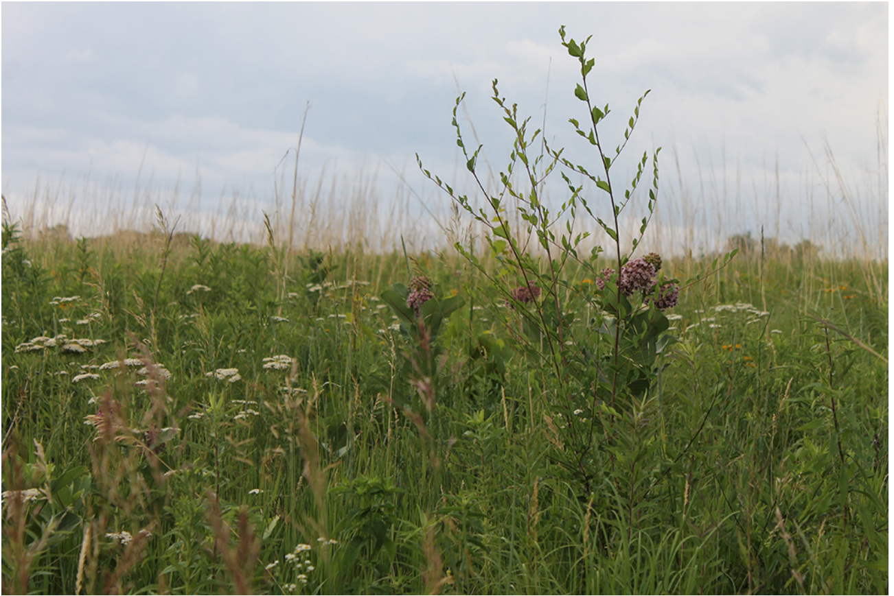
Native prairie grasses grow in the conservation easement established by the Sisters of St. Francis of Dubuque, Iowa.