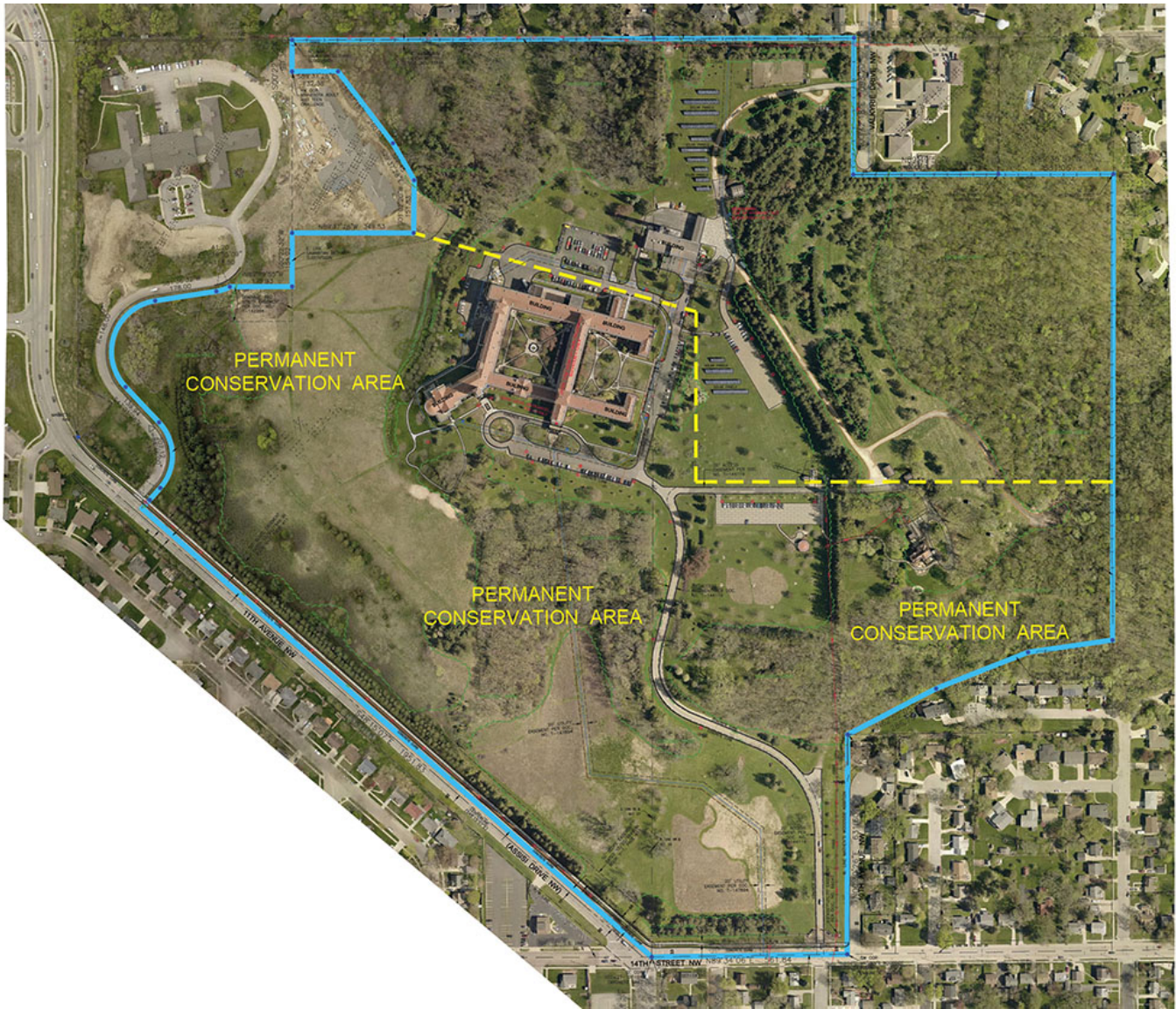
Map of the Sisters of St. Francis motherhouse, Assisi Heights and the conservation easement