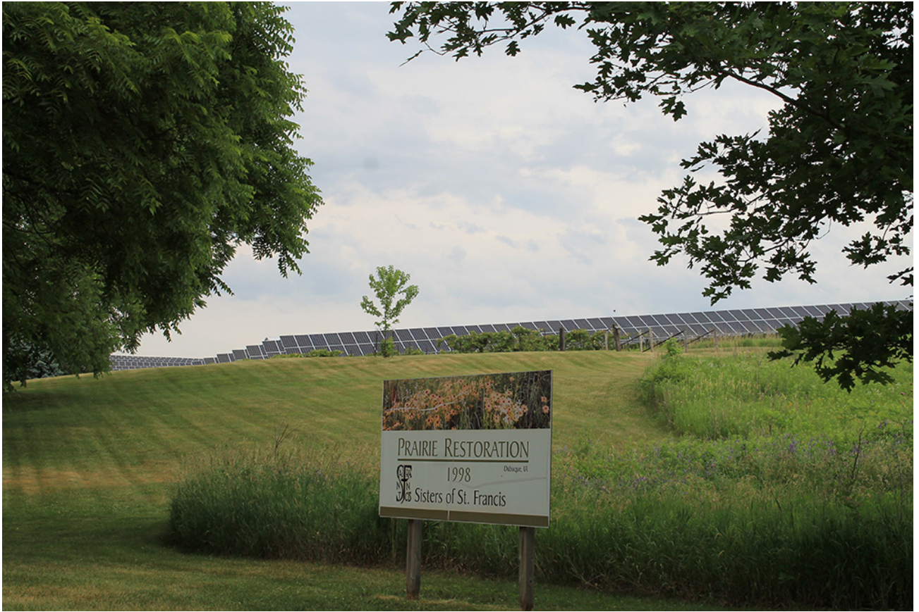
An array of 2,600 solar panels in the background of a restored prairie area at the motherhouse of the Sisters of St. Francis, in Dubuque, Iowa.