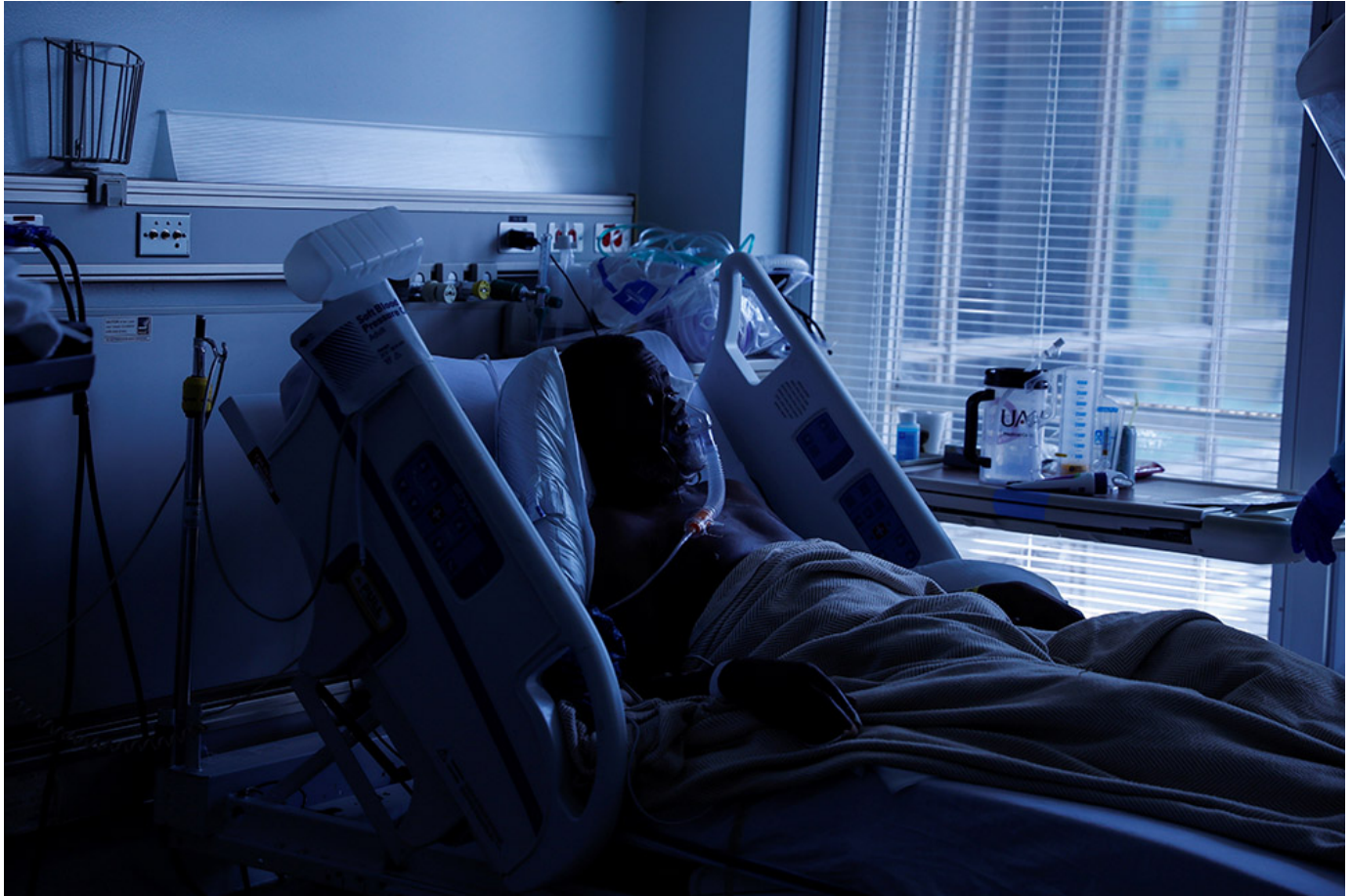
A COVID-19 patient in Little Rock, Arkansas, lays in his isolation room in the COVID-19 unit Aug. 16 at the University of Arkansas for Medical Sciences.

COVID-19 challenge. The central dynamic in that story is the tension that Trump created between the federal government and the states. By steadfastly resisting any coordinated national response to the pandemic he pitted states against each other in their efforts to obtain equipment and medical devices necessary to respond to the health crisis.