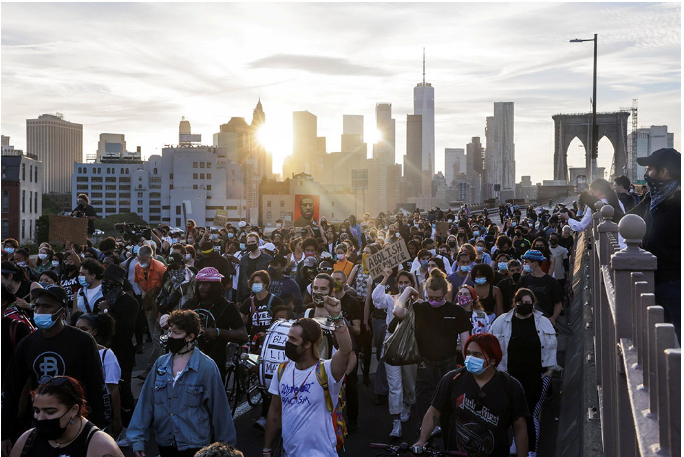
People in New York City march on the Brooklyn Bridge during a demonstration May 25, 2021, on the first anniversary of the death of George Floyd.