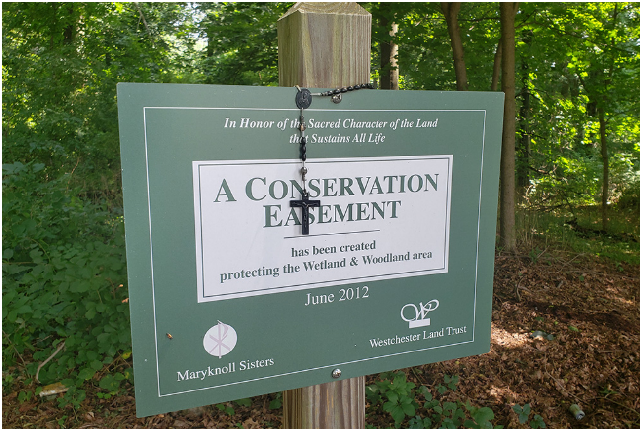
A rosary rests on a sign indicating the Maryknoll Sisters' conservation easement.

"And so we said, 'What does that mean?' It means we work towards just relationships not only with humankind, but with all nature, that we recognize our interconnectedness," she added. "The crisis is such that it is dangerous enough to destroy the whole Earth, and that's what we recognized."