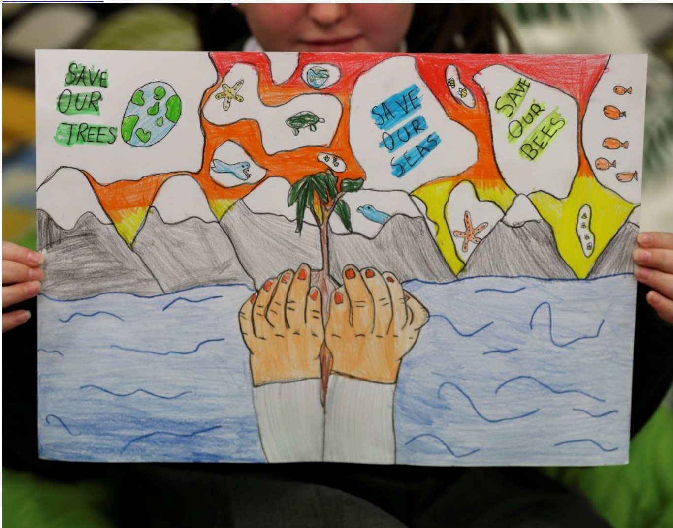
A student holds a poster at St. Conval's Primary School in Glasgow, Scotland, while learning about climate change ahead of COP26, the U.N. Climate Change Conference, which starts Oct. 31.