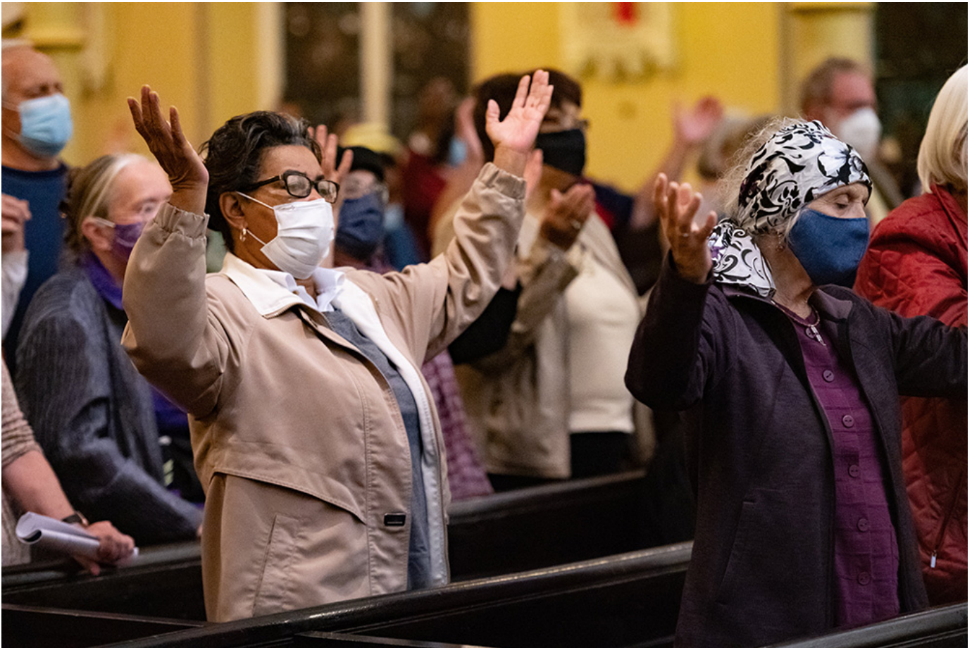
People in Baltimore attend All Saints' Day Mass at St. Ann Church Nov. 1.