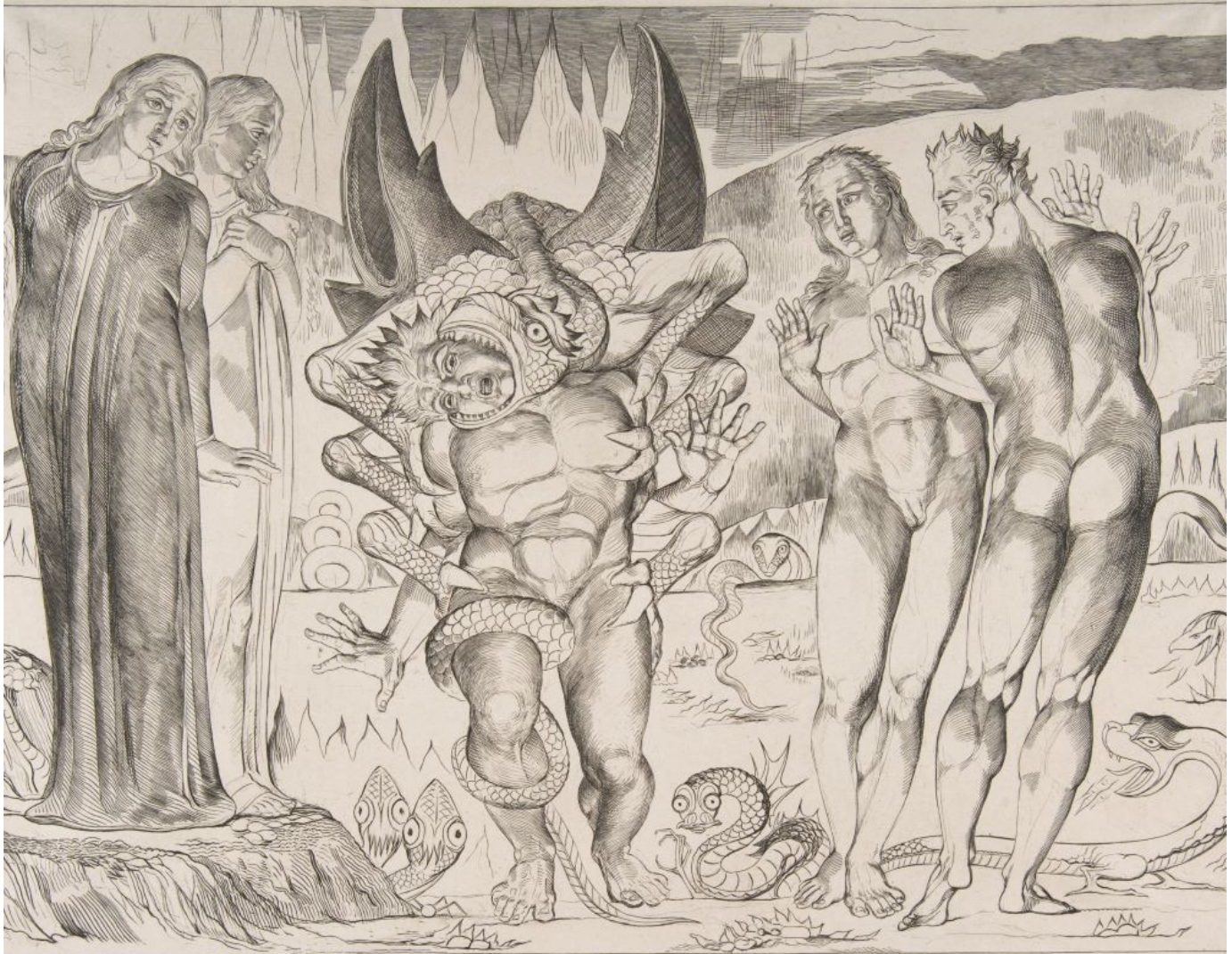
"The Circle of Thieves: Agnello Brunelleschi Attacked by a Six-Footed Serpent," engraving by William Blake, ca. 1825-27