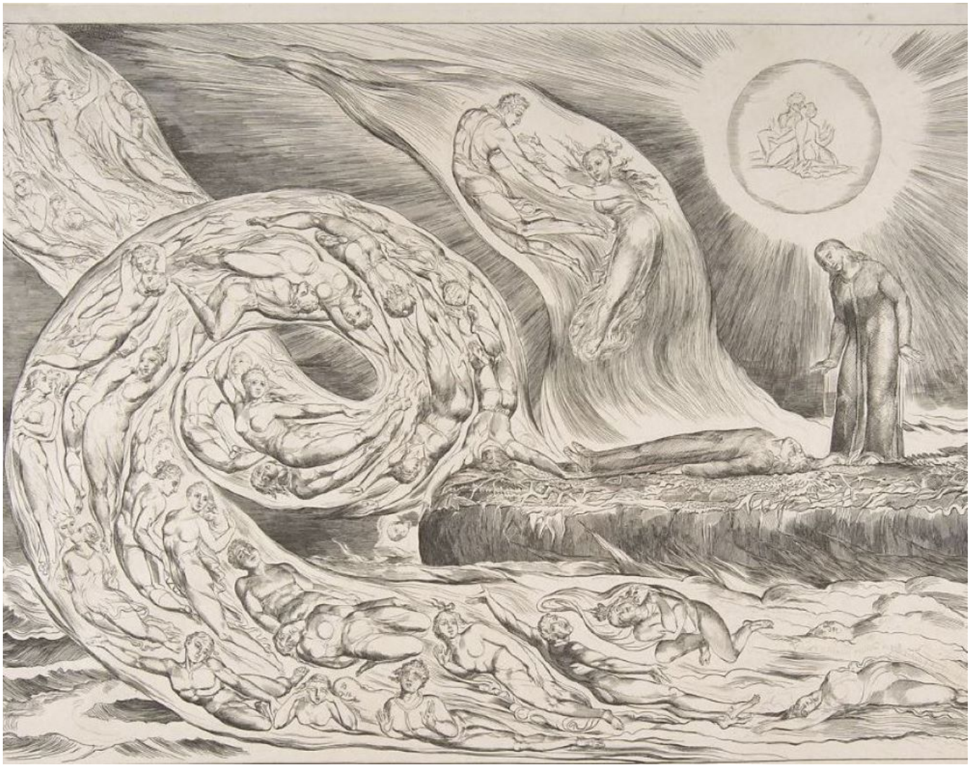
"The Circle of the Lustful: Paolo and Francesca," engraving by William Blake, ca. 1825-27 (Metropolitan Museum of Art/Rogers Fund, 1917)

As with many medieval believers, Dante was heavily influenced by St. Augustine, but his art was hardly the product of monastic-mystical contemplation or Marian visitation. Instead, he was your classic frustrated male poet walking the edge of creepiness with a million chips on his shoulder and an obsession with Beatrice, a local girl he barely knew.