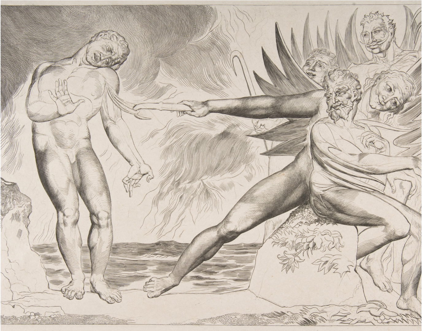
"The Circle of Corrupt Officials: The Devils Tormenting Ciampolo," engraving by William Blake, ca. 1825-27

Reading a book about hell during a global plague runs the risk of feeling redundant. What makes this book different, however, is that, like most of Moore's writing, it is packed with down-to-earth humor and clear prose. With devastating deadpan and straightforward, honest storytelling, Moore skewers the twisted theology that prioritizes belief in a punishing afterlife and inflicts psychic damage on people through guilt and fear.