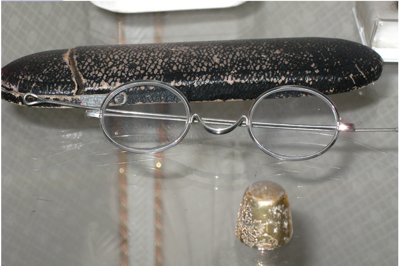
Photo of Blessed Clelia Merloni's reading glasses on display in her bedroom in the Generalate of the Apostles of the Sacred Heart of Jesus in Rome, Italy.