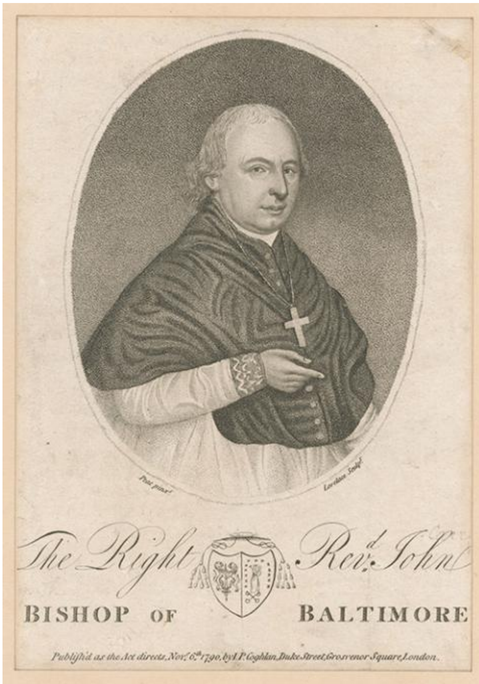
An 18th-century engraving of Bishop John Carroll of Baltimore