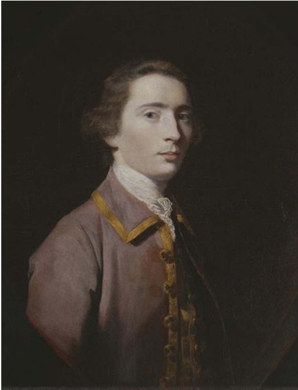
A 1763 portrait of Charles Carroll, who would become the only Catholic signer of the Declaration of Independence (Yale Center for British Art)

It was the unique, pluralistic, revolutionary and opportunistic circumstances that confronted the Founding Fathers that proved decisive. They trusted Catholics like Charles and John Carroll because they had proven themselves trustworthy, because they were "gentlemen" like themselves, men of means and of learning. Non-sectarianism, if not actual secularism, had become a fact of life in the Continental Army as well as the Continental Congress.