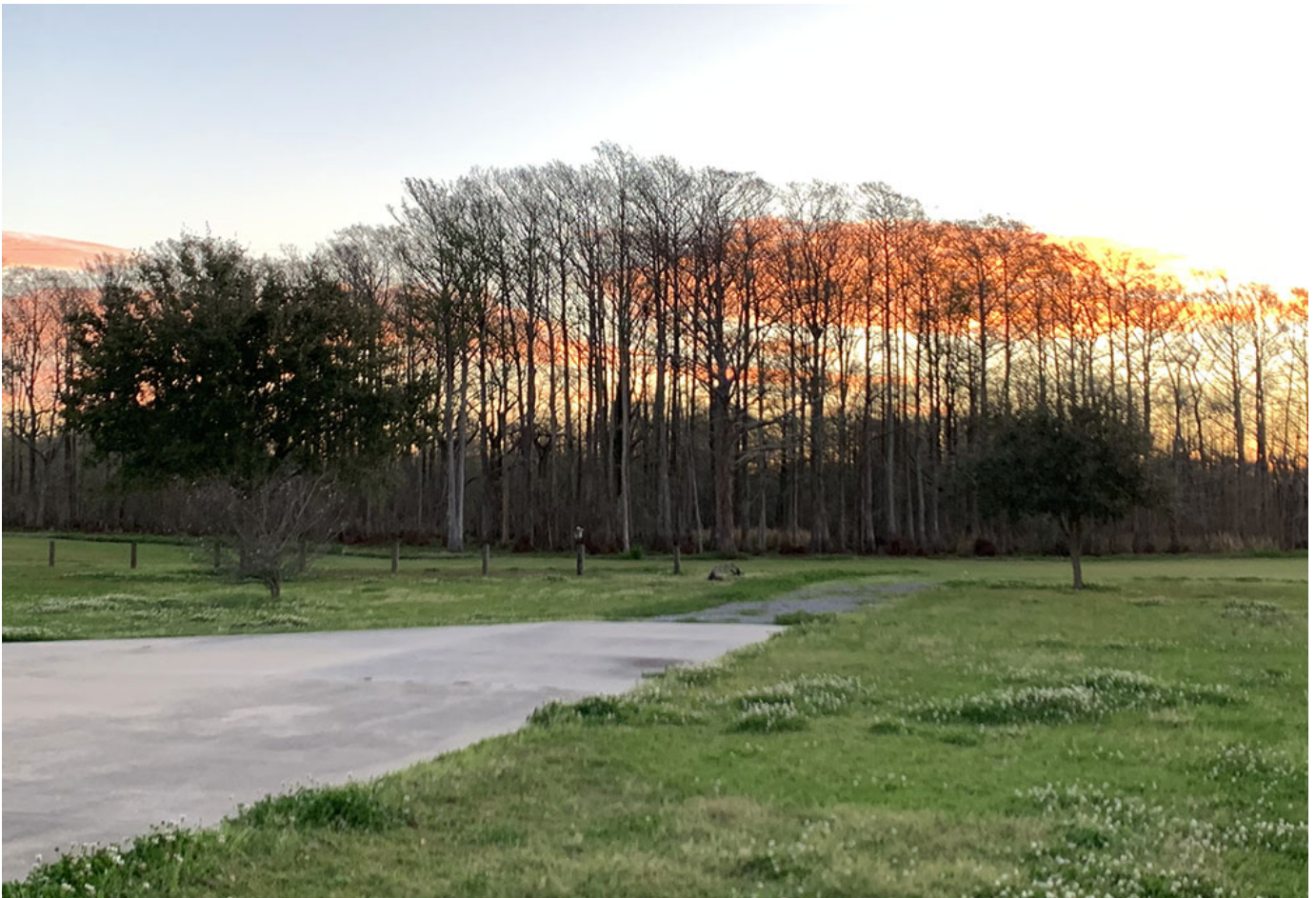
Lake Arthur, Louisiana, before it was devastated by Hurricane Laura