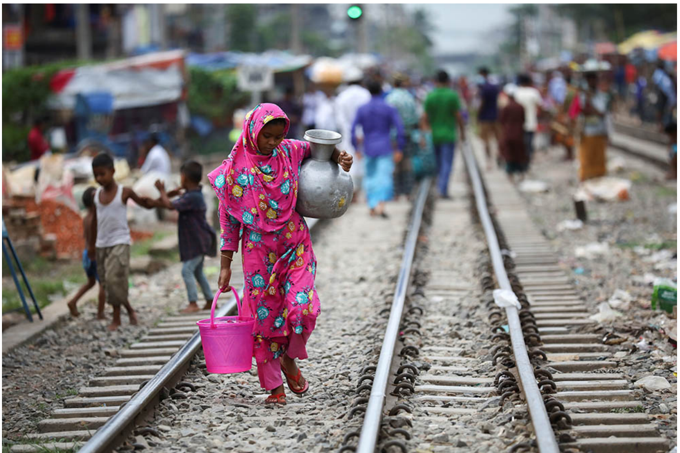
A woman carries drinking water along railroad tracks in a poor section of Dhaka, Bangladesh, Sept. 15, 2020.

Advent — the season of Emmanuel, God-with-us — brings hope to us and is the proclamation of hope to our world.