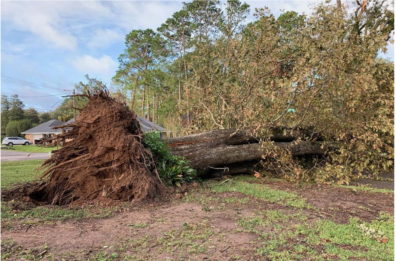
Uprooted oak tree after Hurricane Laura last year, Lafayette, Louisiana

So many trees. Fallen trees. Broken branches and limbs hanging precariously overhead, waiting to plunge to the earth once the fatigue of holding on for too long is just too much. Officially, hurricane season ends on Nov. 30 each year. Then, almost immediately, we make the annual late autumn transition and Advent enters with a soft violet haze of candlelit reminiscence.