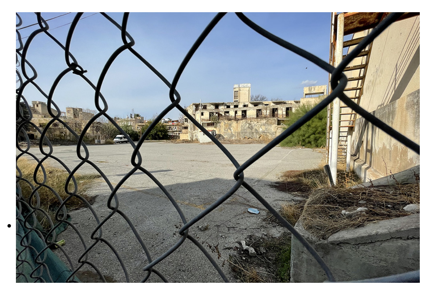
A look inside the U.N. buffer zone of Nicosia, Cyprus