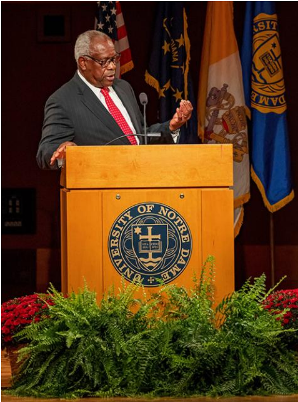
U.S. Supreme Court Justice Clarence Thomas delivers the 2021 Tocqueville Lecture Sept. 16 at the University of Notre Dame in Indiana.