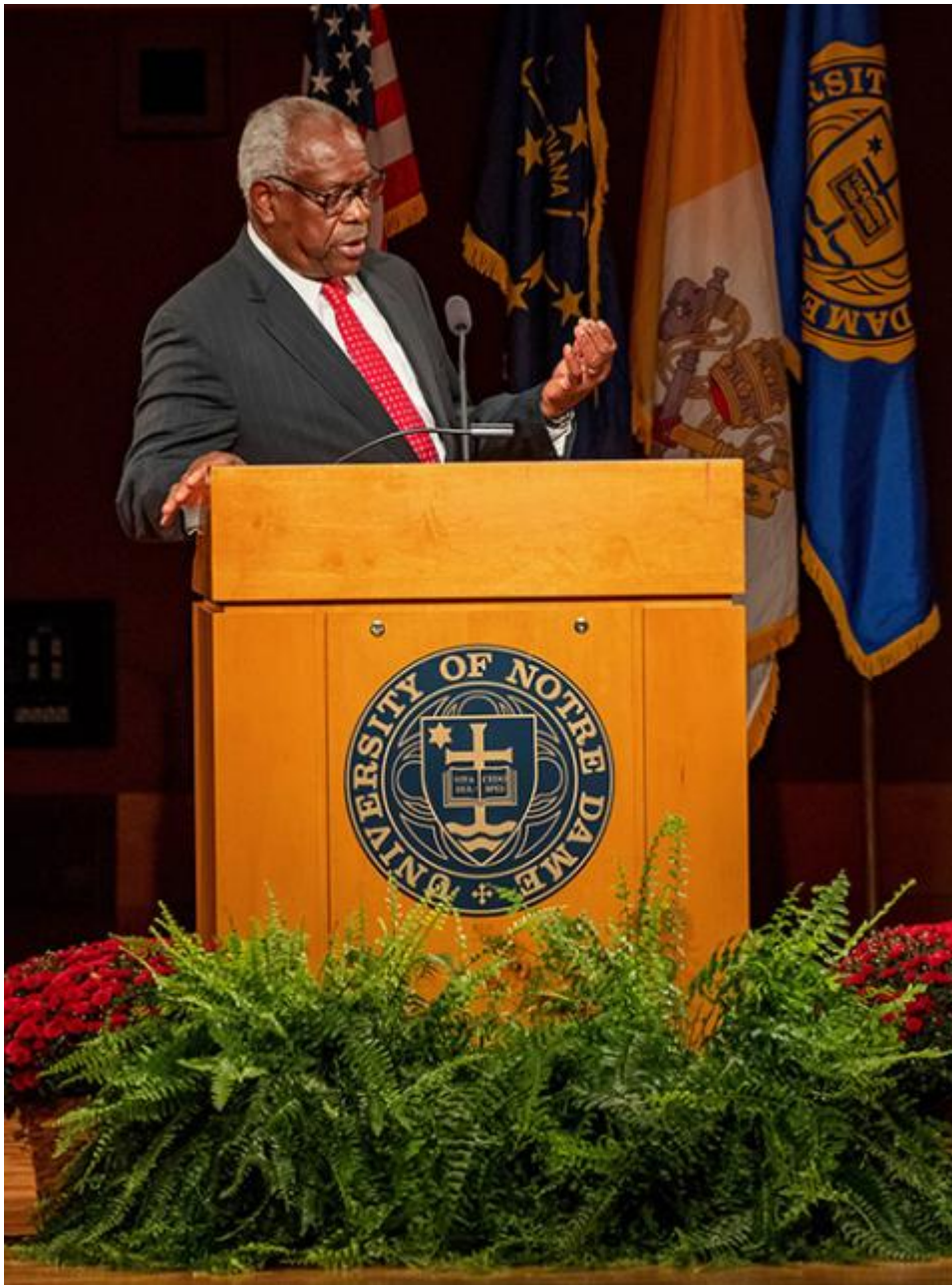
U.S. Supreme Court Justice Clarence Thomas delivers the 2021 Tocqueville Lecture Sept. 16 at the University of Notre Dame in Indiana.