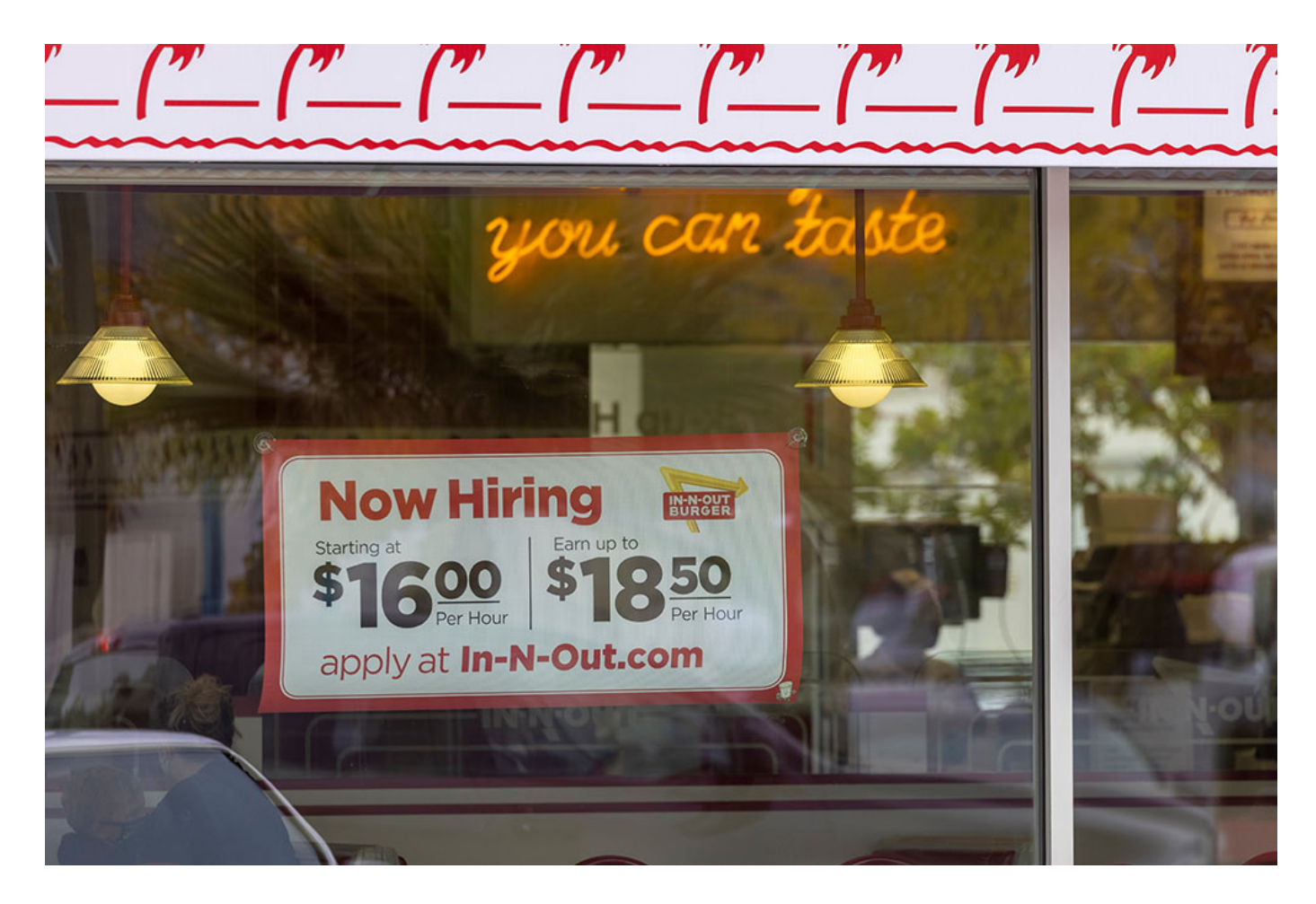
An In-N-Out Burger in Encinitas, Calif., advertises for workers May 10, 2021.

Biden and the Democrats need to find 21st-century means of articulating and following one of the truths of 20th-century politics: If voters go into the polling booth thinking of themselves as workers, the Democrats win; but if they go into the polling booth thinking of themselves as taxpayers, the Democrats lose. And if voters go into the polling booth feeling like taxpayers paying for cultural fads, Democrats get trounced.