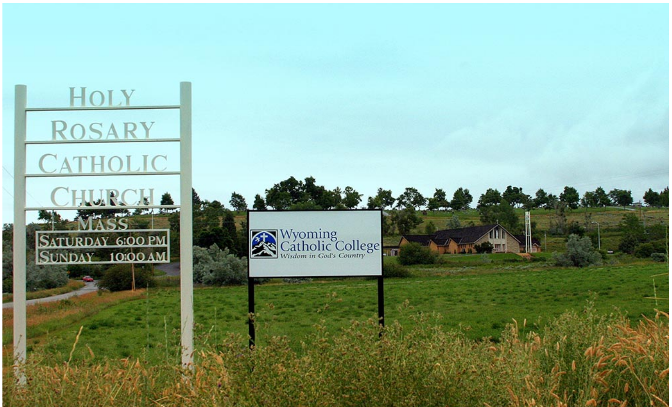
A view of Wyoming Catholic College's campus in Lander