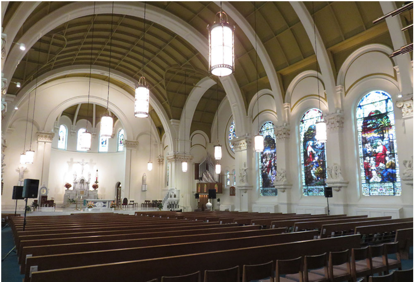
The interior of the Cathedral of Our Lady of Lourdes in Spokane, Washington

The Spokane diocese — led by Bishop Thomas Daly, an outspoken conservative prelate — received $10,000 for its annual Catholic appeal and $500 to support a local Catholic school. The Cathedral of Our Lady of Lourdes in Spokane was given $15,000 for general operations.