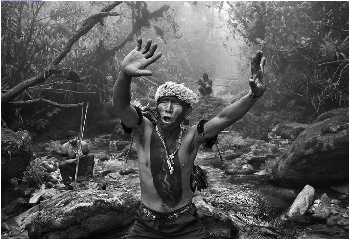
A Yanomami shaman converses with spirits before climbing Mount Pico da Neblina in 2014 in Amazonas state, Brazil.