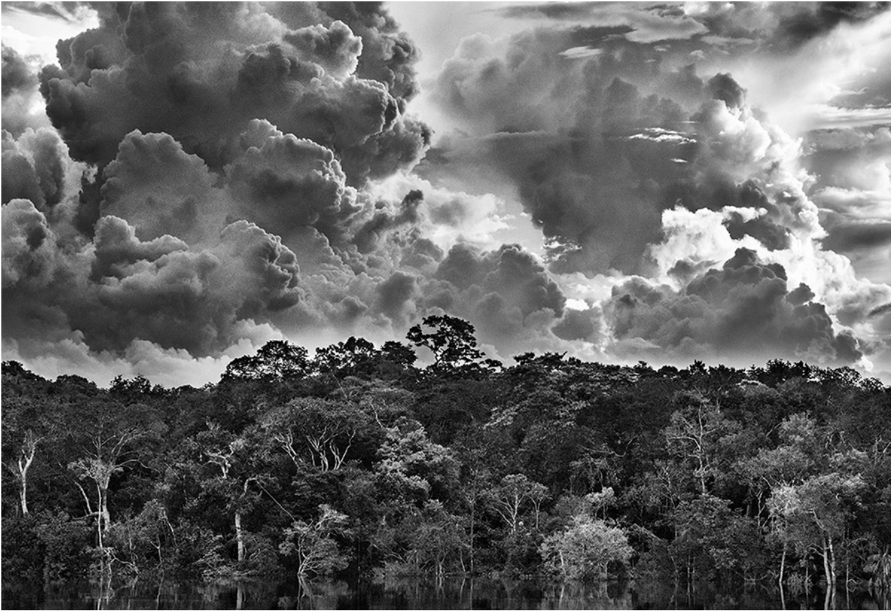
Fluvial archipelago of Mariuã; in 2019 in Amazonas state, Brazil

That call for attentiveness is one that Pope Francis has made since October 2017 when he announced a special synod on the Amazon, one meant to discuss both the pastoral needs of the remote region and to help awaken the world's attention to its destruction.