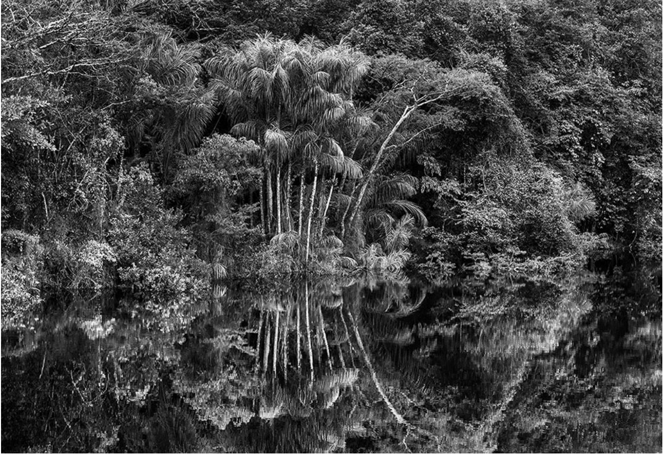
Rio Ja o in 2019 in Amazonas state, Brazil (   Sebastião Salgado/Contrasto)