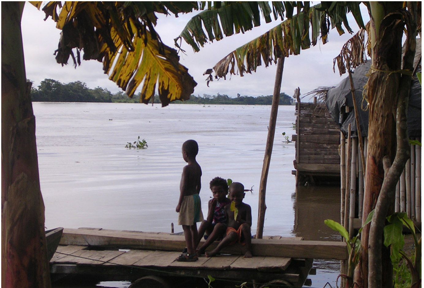
A child looks out on the Atrato River in the Chocó region of Colombia.

In their outreach to communities along the Atrato, the river guardians have focused on education and advocacy campaigns to raise awareness and understanding about the court ruling and its implications. They have developed a website, a local newspaper, infographics and a social campaign called "We Are All Guardians of the Atrato."