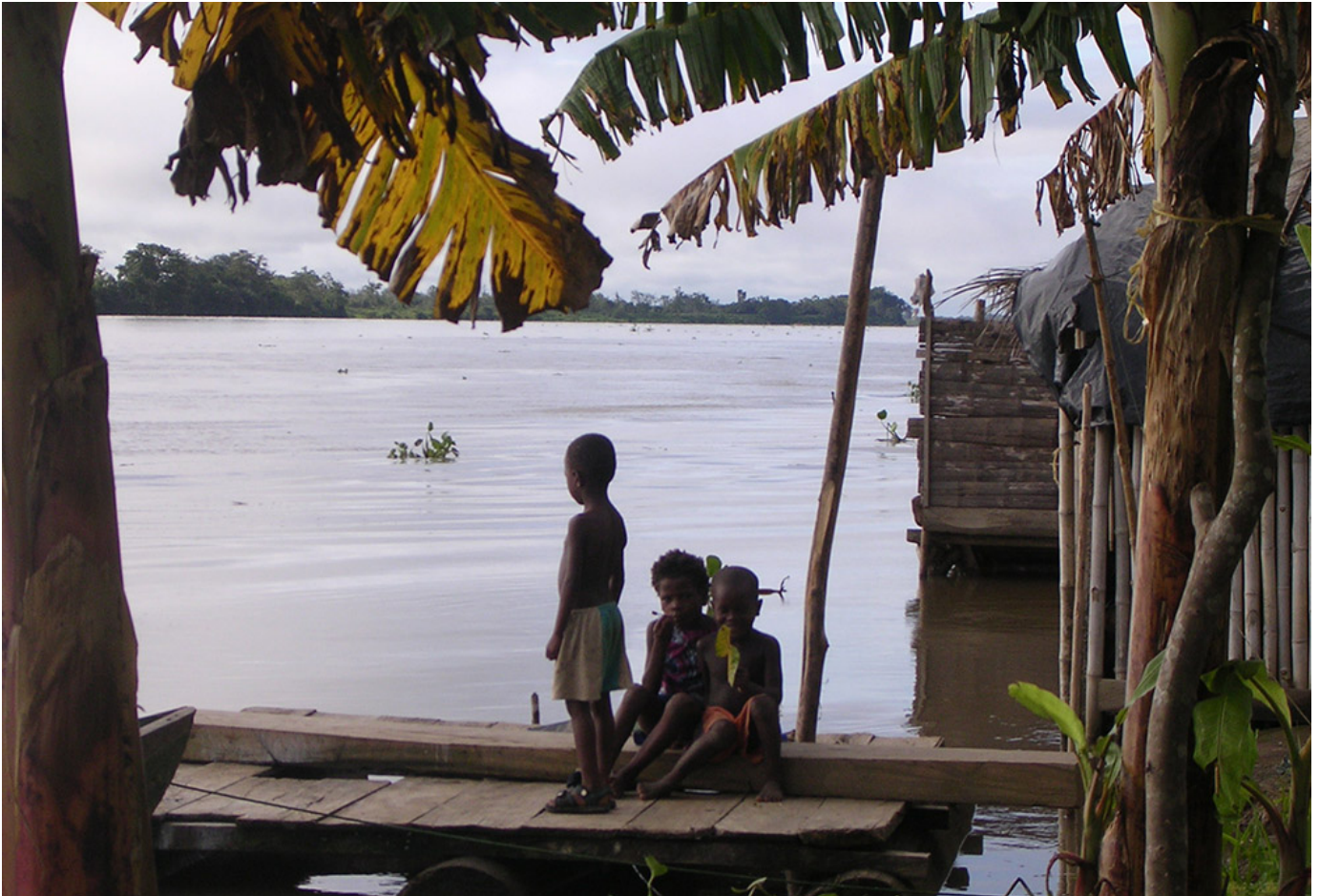
A child looks out on the Atrato River in the Chocó region of Colombia.

In their outreach to communities along the Atrato, the river guardians have focused on education and advocacy campaigns to raise awareness and understanding about the court ruling and its implications. They have developed a website, a local newspaper, infographics and a social campaign called "We Are All Guardians of the Atrato."