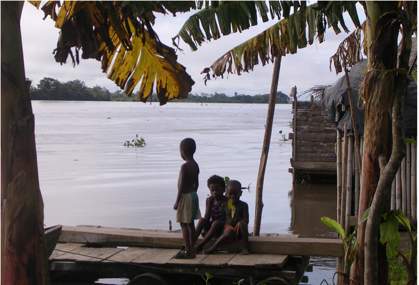
A child looks out on the Atrato River in the Chocó 3 region of Colombia.

In their outreach to communities along the Atrato, the river guardians have focused on education and advocacy campaigns to raise awareness and understanding about the court ruling and its implications. They have developed a website, a local newspaper, infographics and a social campaign called "We Are All Guardians of the Atrato."