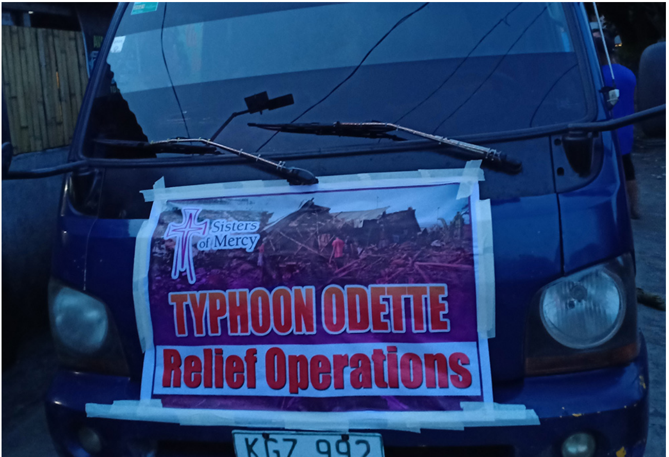
One of the vehicles the Mercy Sisters from Mindanao used to carry the relief goods they brought to Southern Leyte in the Visayas.