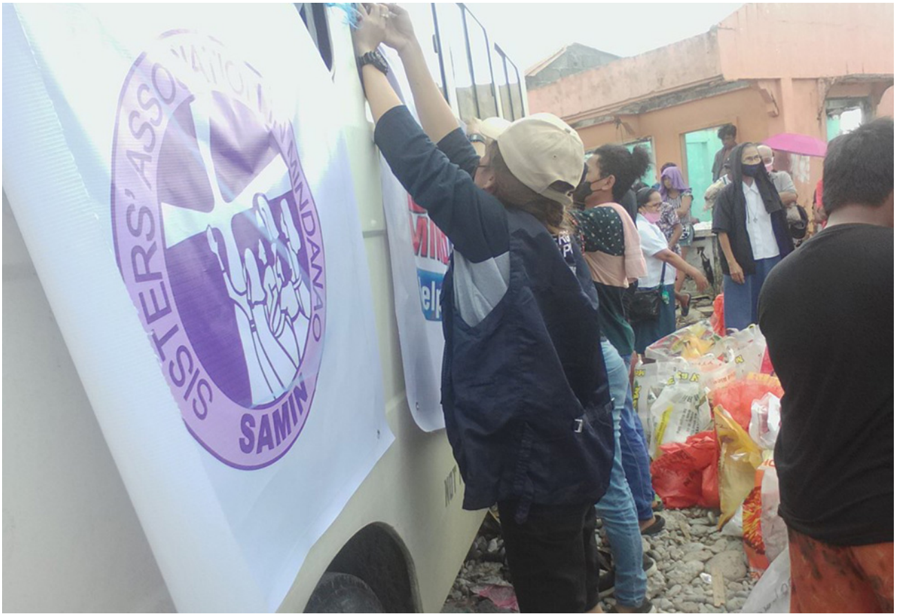
Members of the relief team tie banners displaying Sisters Association of Mindanao and Balsa Mindanao onto their vehicles so the people can identify them.