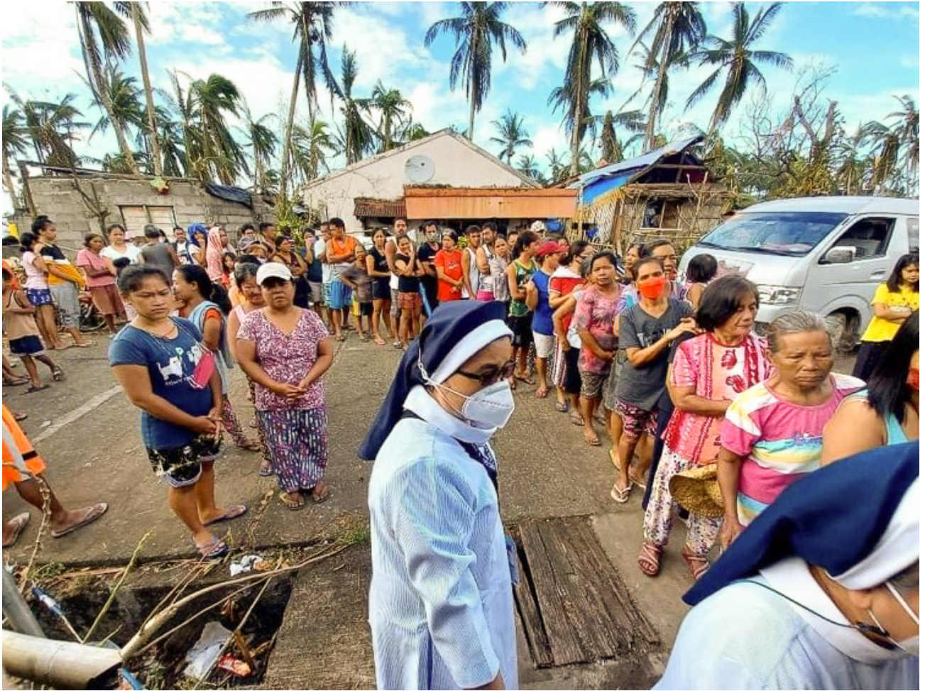
A Mercy sister oversees the distribution of relief goods in San Francisco, Southern Leyte.