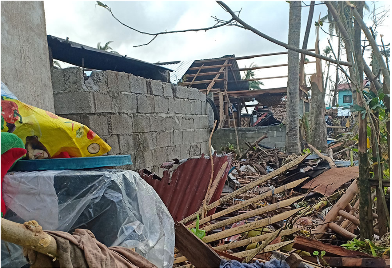
Debris from houses and fallen trees in San Francisco, Southern Leyte.

They immediately left the town to return to Mindanao to prepare for other missions, she said, but had to wait for 20 hours at the port to get a ferry back.