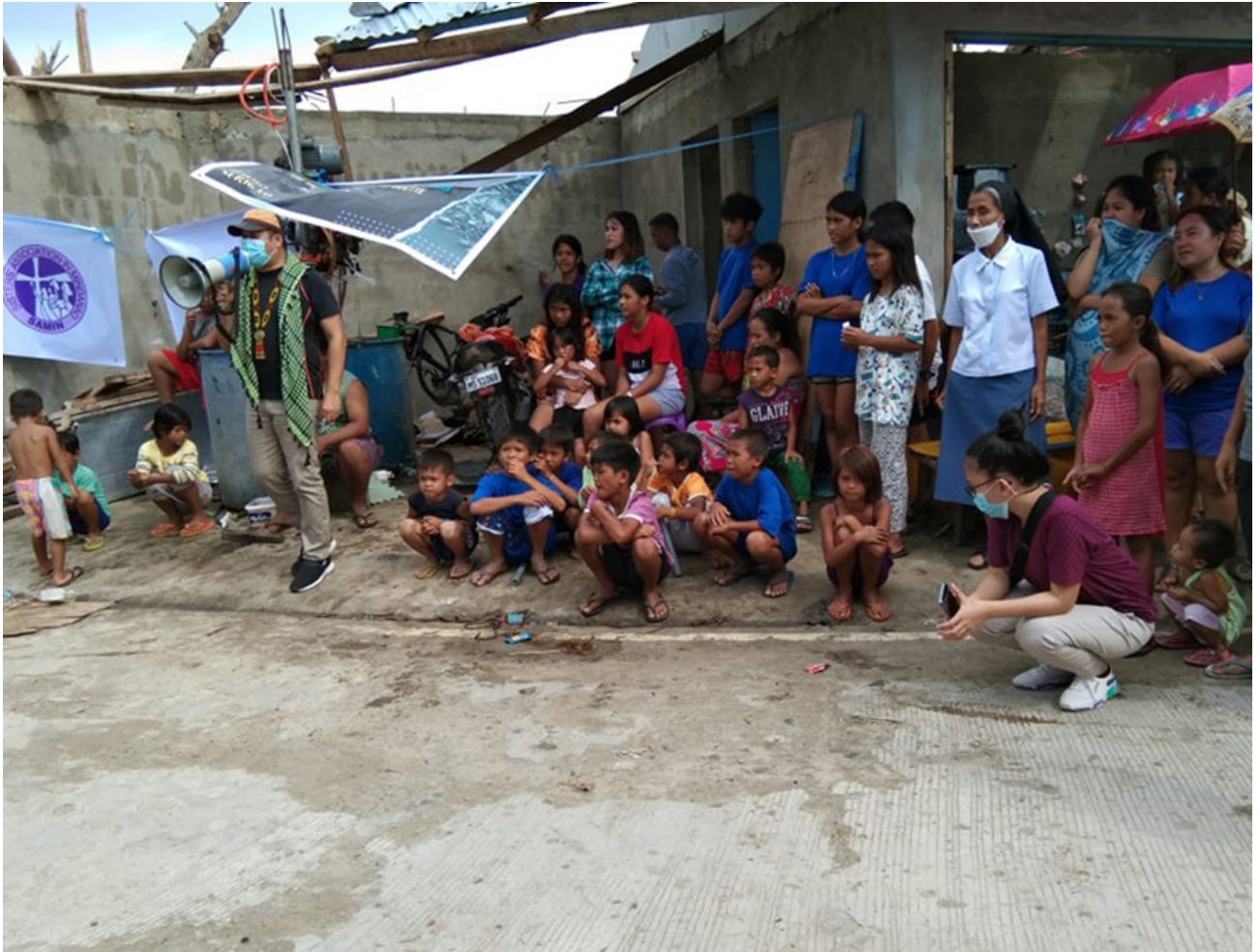
Children and a few adults wait for their parents and relatives who are in line to receive relief goods in one of the distribution areas along a coastal community in Surigao City.