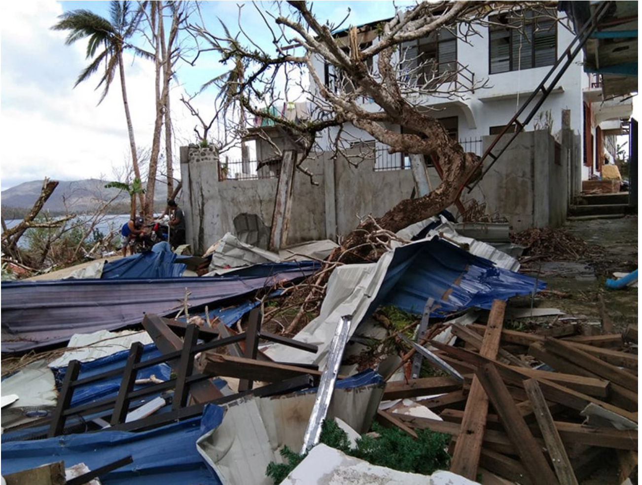
The rubble of the church's roof of San Isidro Labrador Parish in the town of Loreto on the Dinagat Islands, in the Philippines.