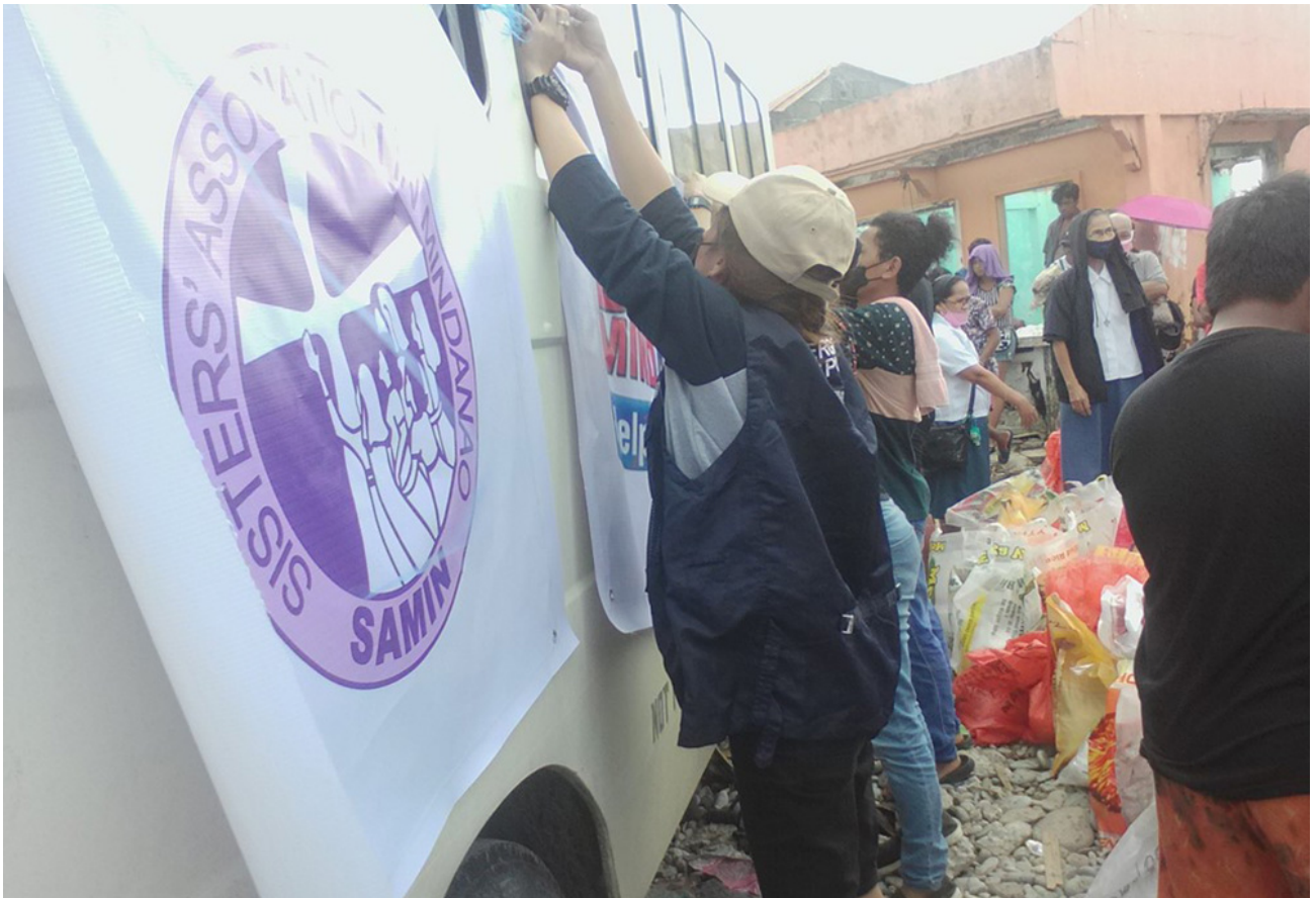
Members of the relief team tie banners displaying Sisters Association of Mindanao and Balsa Mindanao onto their vehicles so the people can identify them.