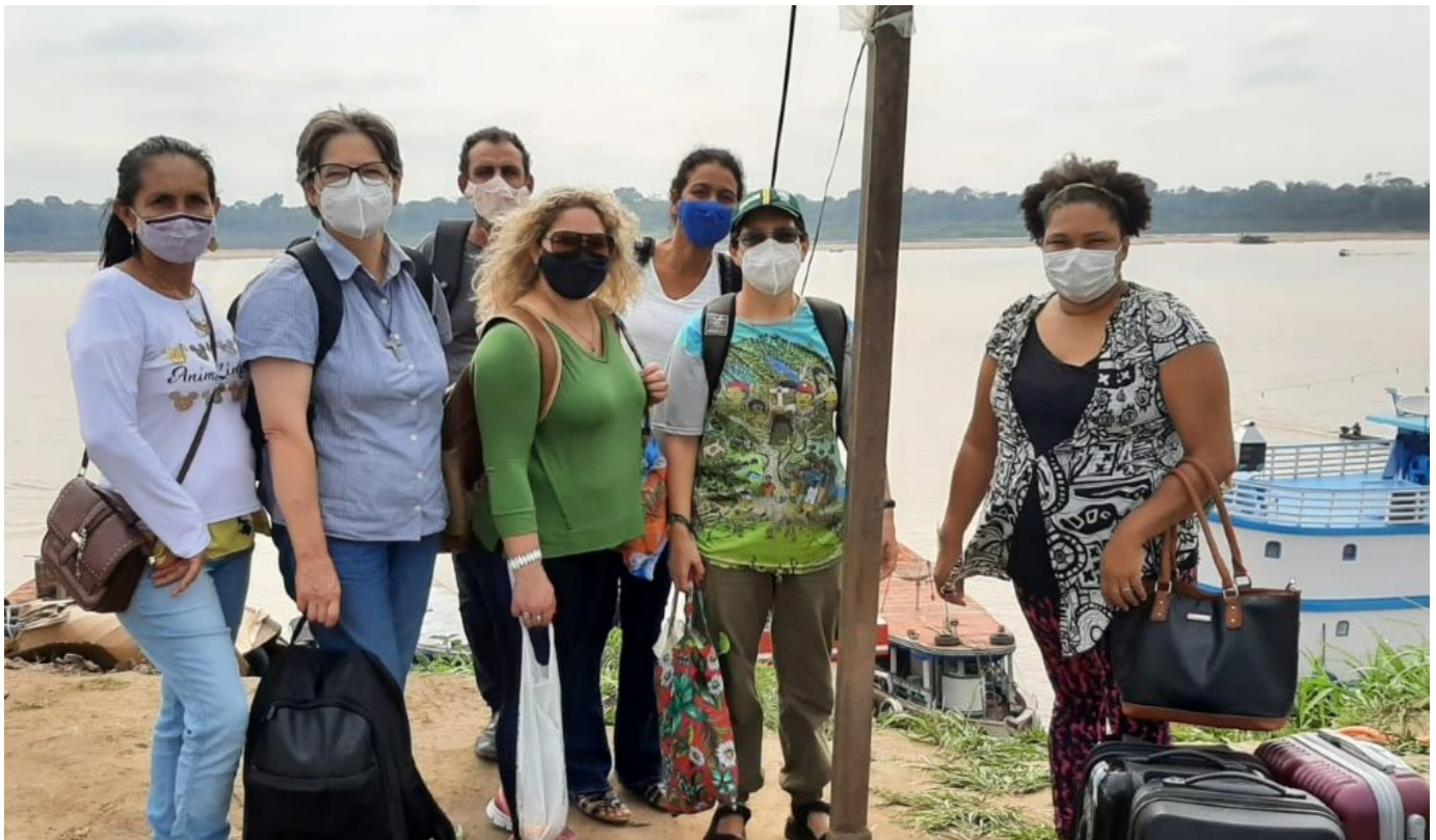
A group from the ant-trafficking network A Cry for Life prepares to leave for a trip down the Amazon River to work with women.

When the police rescued her, the Network provided a hidden place away from her parents' house and psychospiritual therapy till she was in a condition to take care of herself and her daughters. Then she and her daughters were relocated to an unknown place to keep the traffickers from finding them. As you can imagine, once a person falls into this trap, the way out is difficult; many victims die by suicide, or the traffickers kill them.