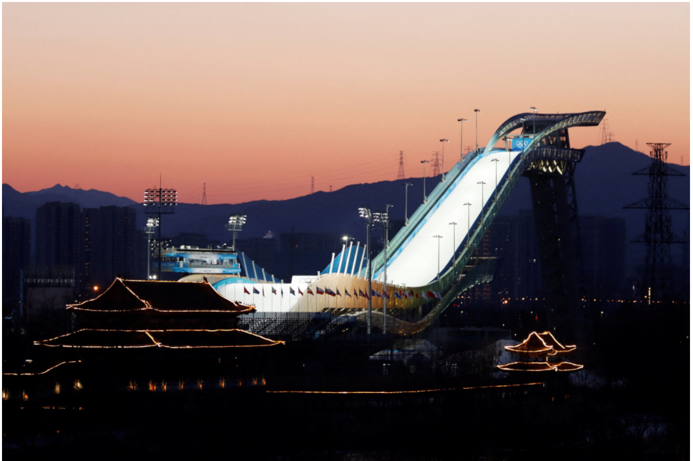
Big Air Shougang, a competition venue for the Beijing 2022 Winter Olympics, is seen at the Shougang Park during sunset in Beijing Feb. 2, 2022.

"We've had to launch like 20km further up the river because there's no water left in the dam, which is crazy. When we first went to Katse Dam in 2013, it was like 80 to 90% full. And to actually look at the water receding, it's really, really scary."