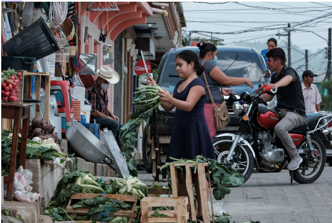
People are seen in El Paraiso, Honduras, July 24, 2021.