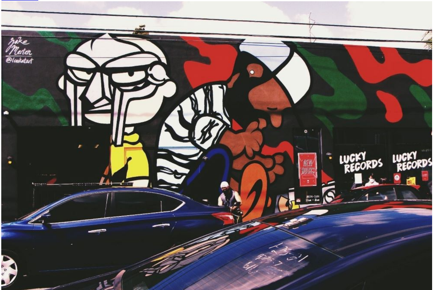
A mural of hip-hop artists J Dilla and MF Doom