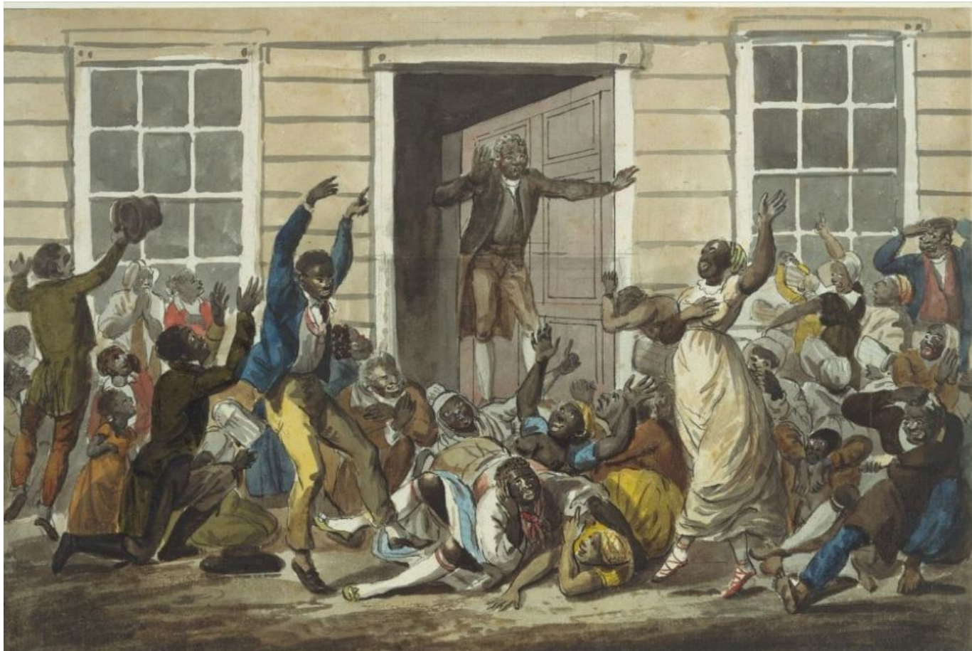
"Black Methodists Holding a Prayer Meeting" by Pavel Petrovich Svinin, circa 1811-1813