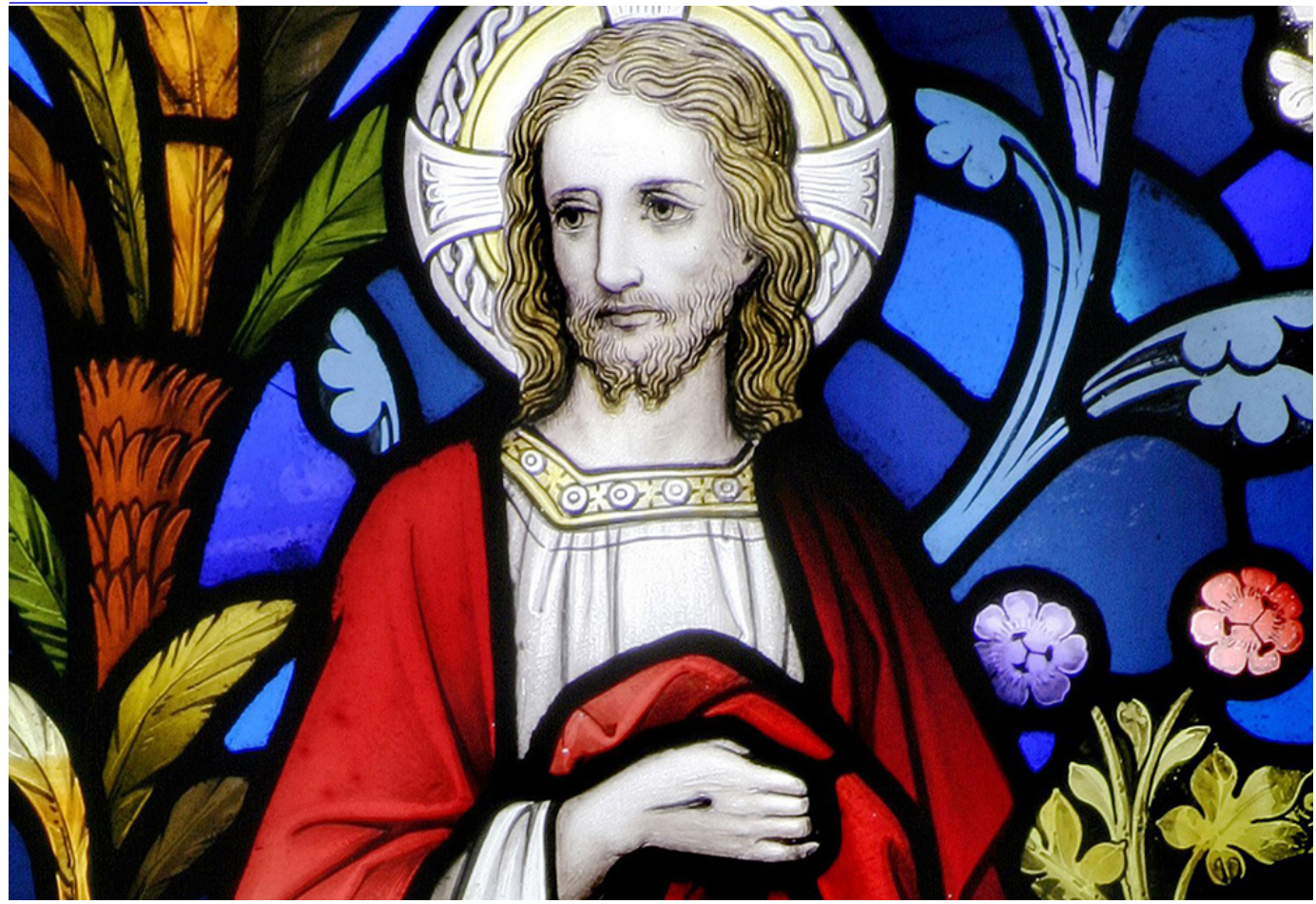
The risen Christ is portrayed in a window at St. Mary Cathedral in Killarney, Ireland.