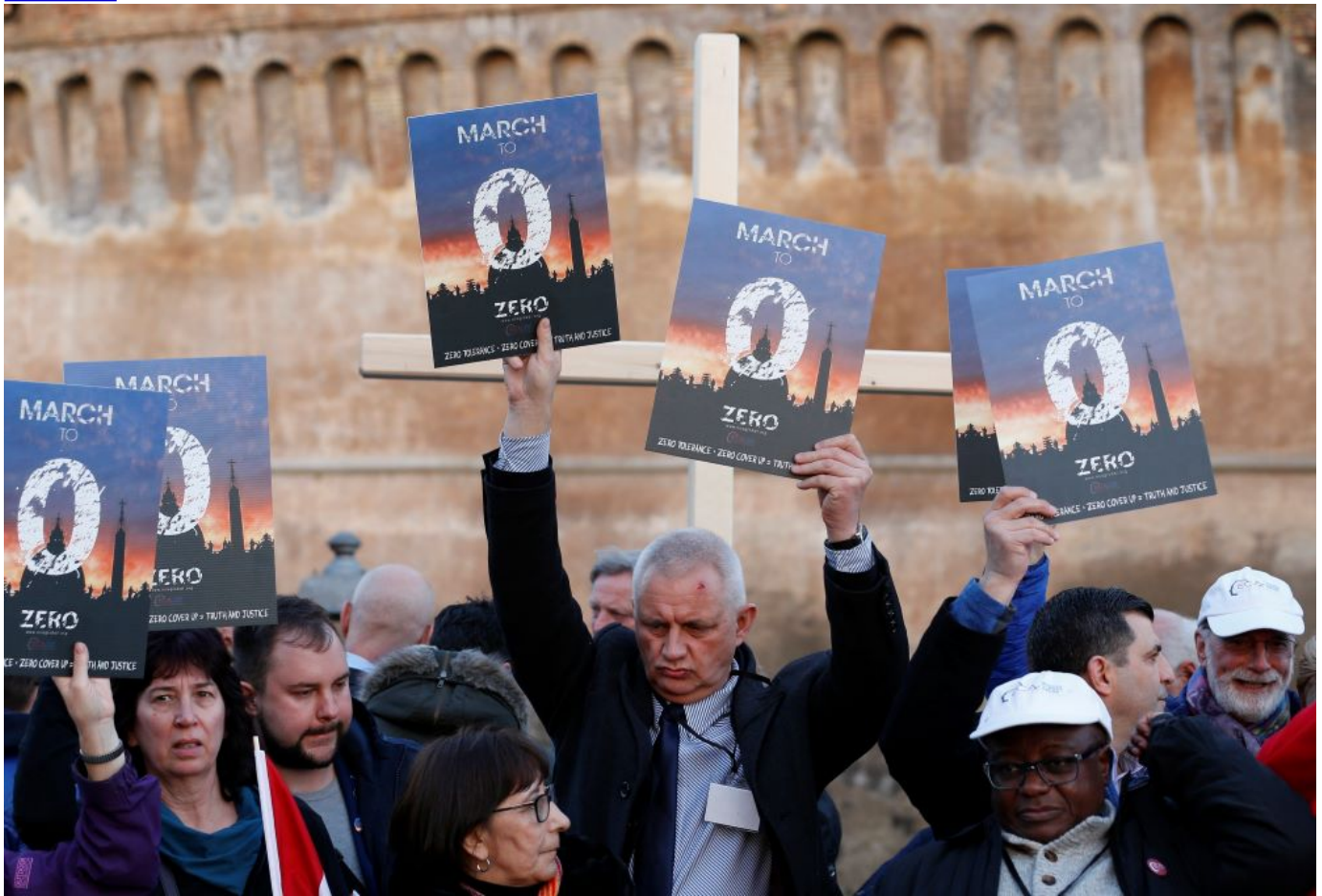
Clerical sex abuse survivors and their supporters rally outside Castel Sant'Angelo in Rome in this Feb. 21, 2019, file photo.