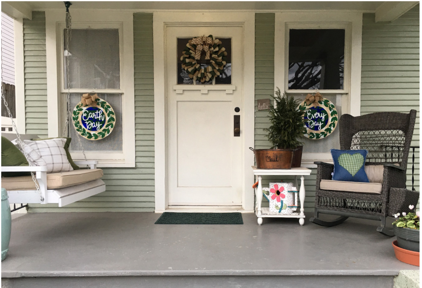
Anne's front porch