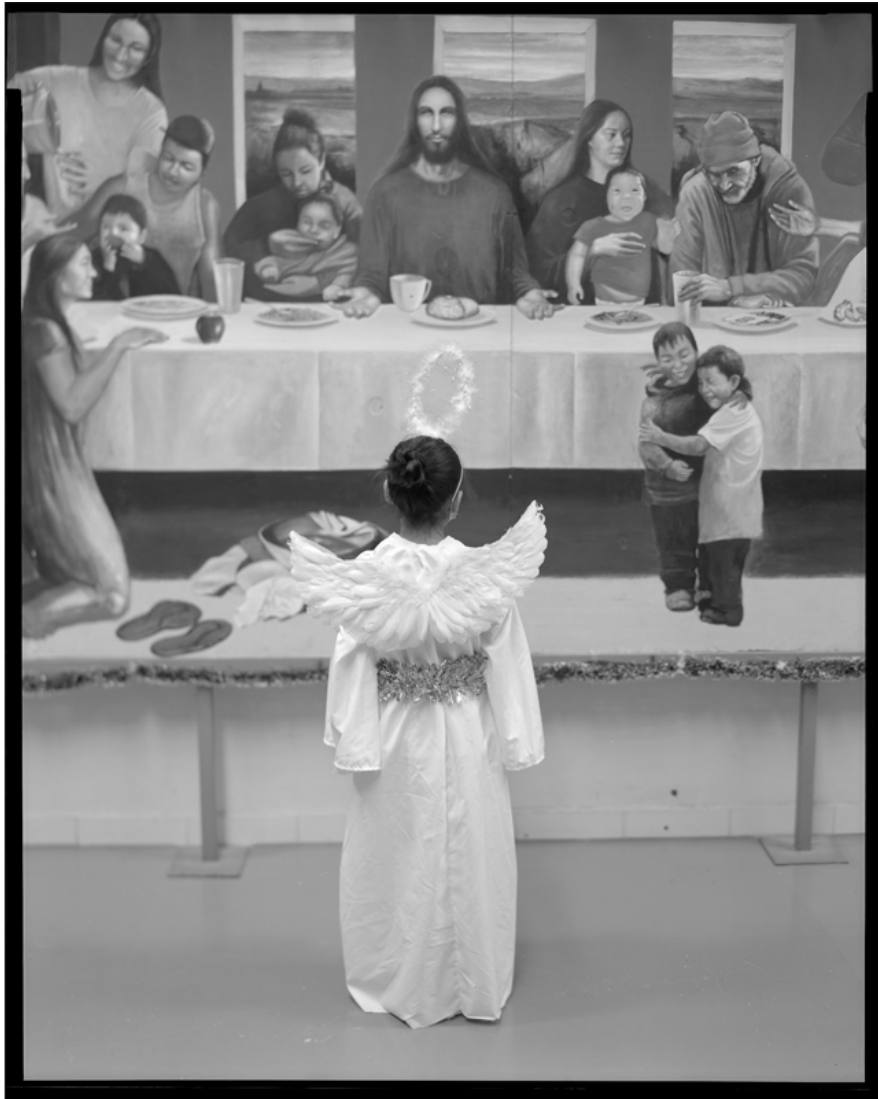
A child is dressed as an angel for Las Posadas (The Inns), a religious festival celebrated in Mexico and various Latin America countries. Families dress as Joseph and Mary to reenact the Holy Family's journey from Nazareth to Bethlehem in search of a safe place to give birth to Jesus. The child dressed as an angel stands in front of the Last Supper mural at the Kino Border Initiative, less than half a mile from the Mariposa border crossing.