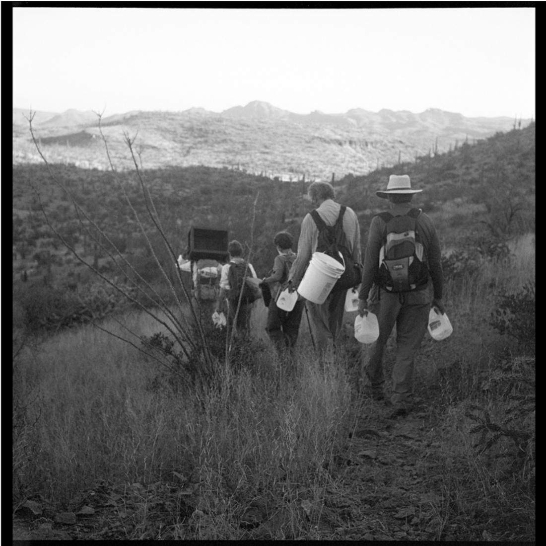
Each volunteer carries as much water, blankets, food and socks as they can. Some carried 4 or 5 gallons of water, a weight of about 30-40 pounds. (Lisa Elmaleh)