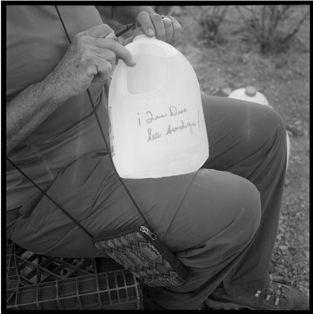
Messages are written on the water bottles left, wishing the migrants blessings and luck.