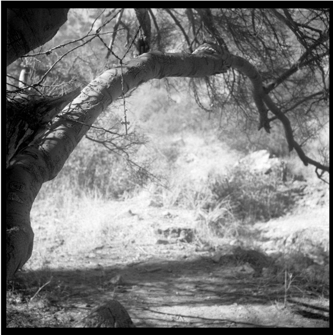
Two rosaries have been left in this tree by Samaritan volunteers for migrants, who know this spot on the trail north as a water drop-off site. (Lisa Elmaleh)