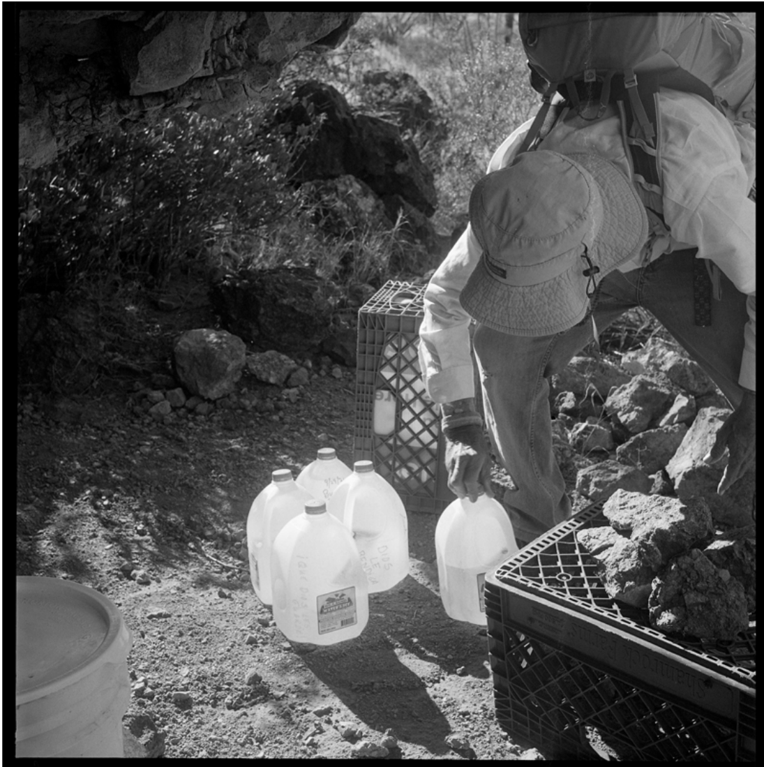
A volunteer takes the empty jugs back, and leaves a half-full one just in case. (Lisa Elmaleh)