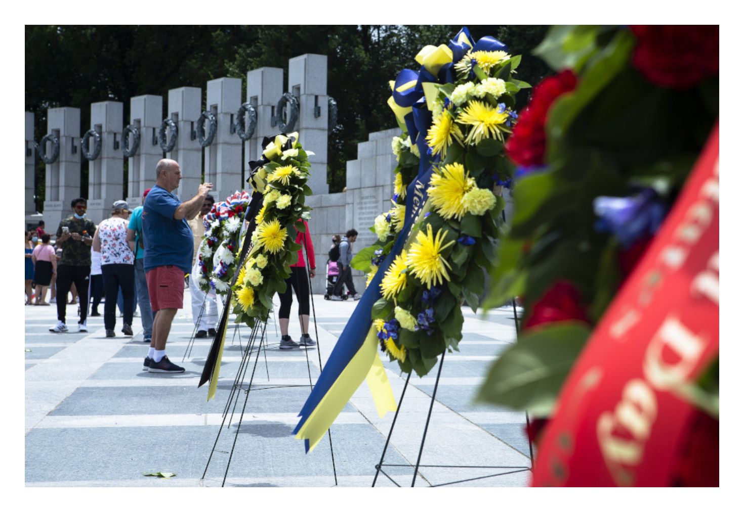
People are seen at the World War II Memorial in Washington during Memorial Day May 31, 2021.

It is interesting that U.S. monuments to war, with few exceptions, commemorate the fallen, not the war.