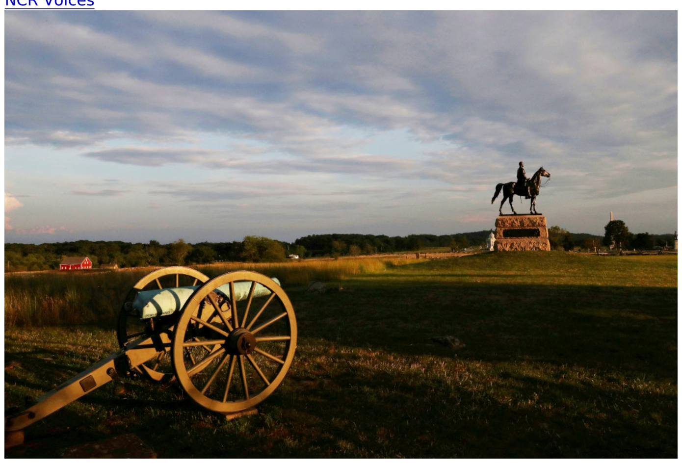
Gettysburg National Military Park in Gettysburg, Pennsylvania, is seen Aug. 11, 2020.