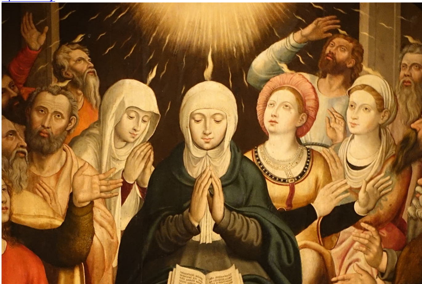
"Pentecost" (detail) by an unknown 16th-century painter in Portugal