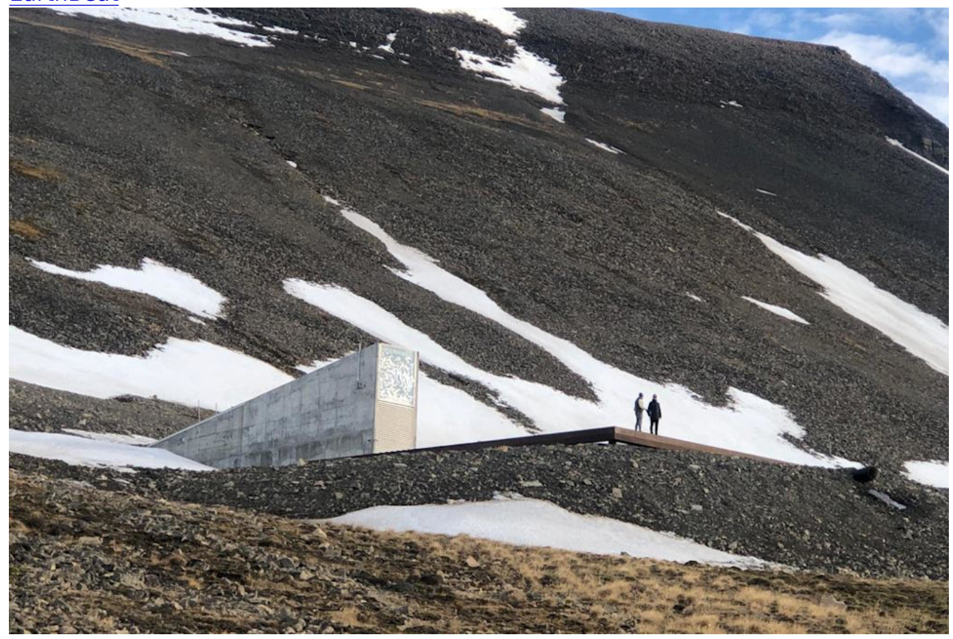
The Global Seed Vault in Svalbard, Norway.