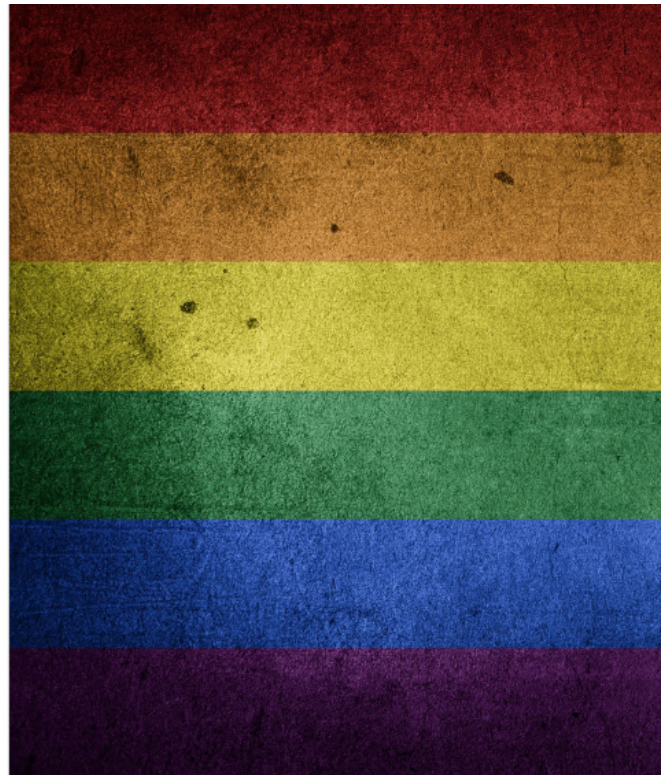
The Vatican City flag, left, and a pride flag.