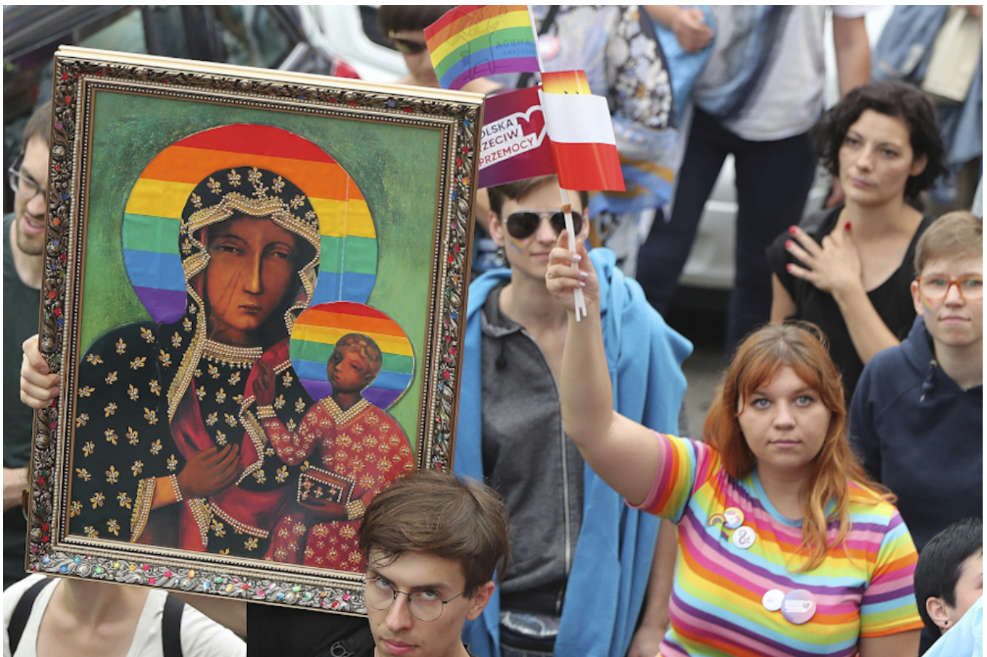
LGBTQ activists and supporters gather for the first-ever pride parade in the central city of Plock, Poland, on Aug. 10, 2019.

"In all honesty, if you had told us as young boys who wasted countless hours of our lives in church trying to 'pray the gay away' that we someday would be standing in front of all of you in our Catholic Church talking about our family on Father's Day, we would never have believed you," they said in their reflection.