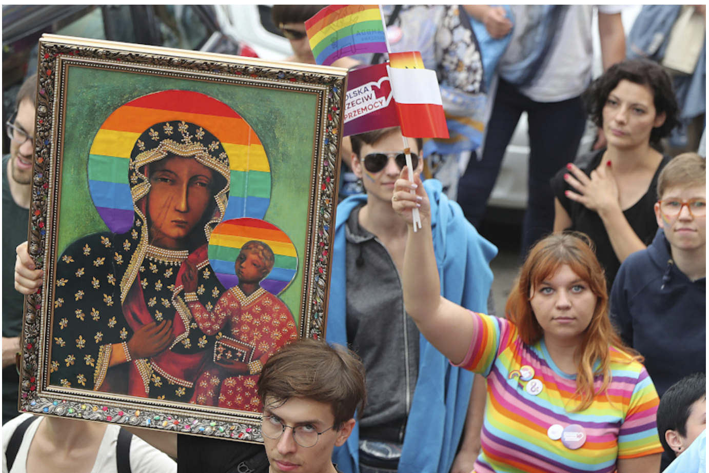
LGBTQ activists and supporters gather for the first-ever pride parade in the central city of Plock, Poland, on Aug. 10, 2019.

"In all honesty, if you had told us as young boys who wasted countless hours of our lives in church trying to 'pray the gay away' that we someday would be standing in front of all of you in our Catholic Church talking about our family on Father's Day, we would never have believed you," they said in their reflection.