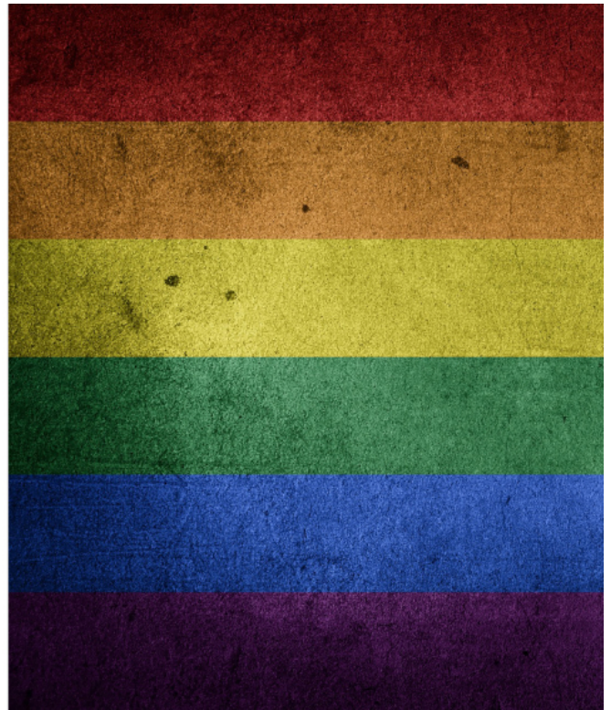
The Vatican City flag, left, and a pride flag.