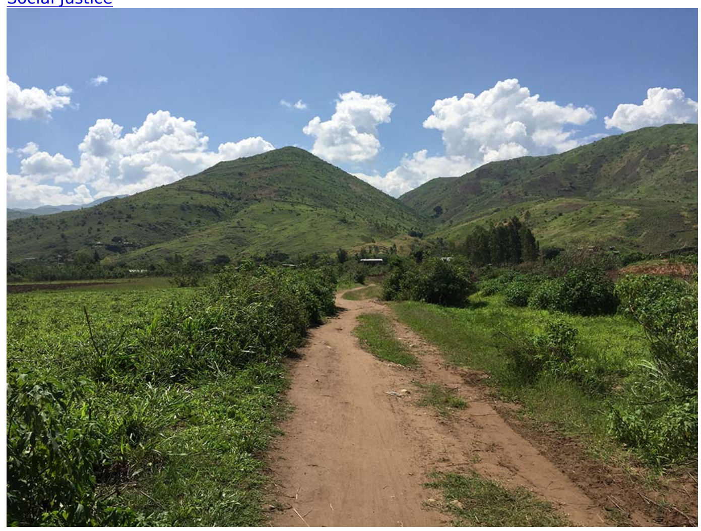
View of a road in the South Kivu region of Democratic Republic of Congo