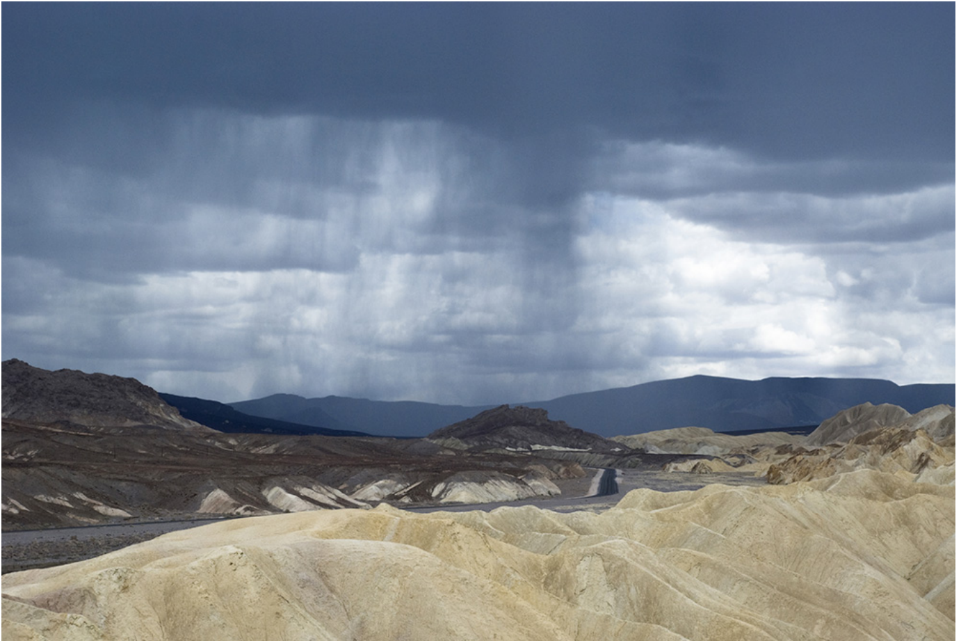
Rain clouds are seen over the landscape in Death Valley National Park, California

Another was reconciliation with my deeper self, a letting-go of old images and old stories and reconciling them with the deeper ones I discovered that lived within me. When we do this work, we create new worlds for ourselves.