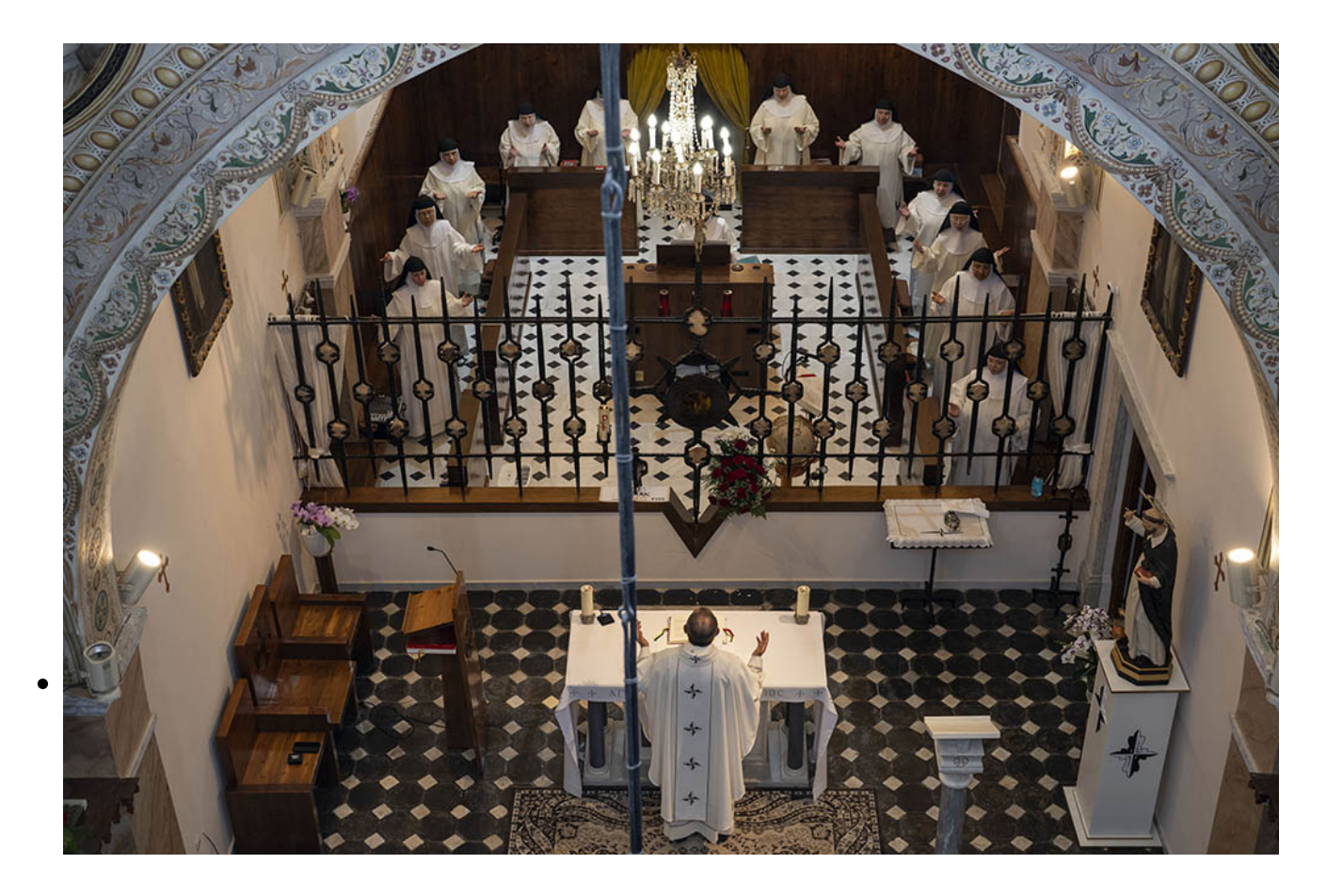
A priest celebrates Mass with cloistered nuns in the Catholic Monastery of St. Catherine on the Greek island of Santorini June 14.