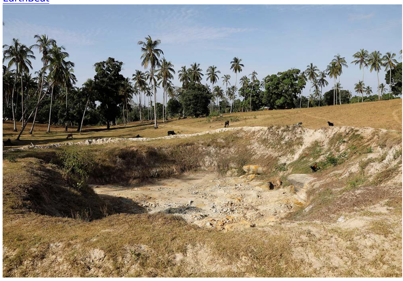
A dried-up water hole is seen in Kilifi, Kenya, on Feb. 16.