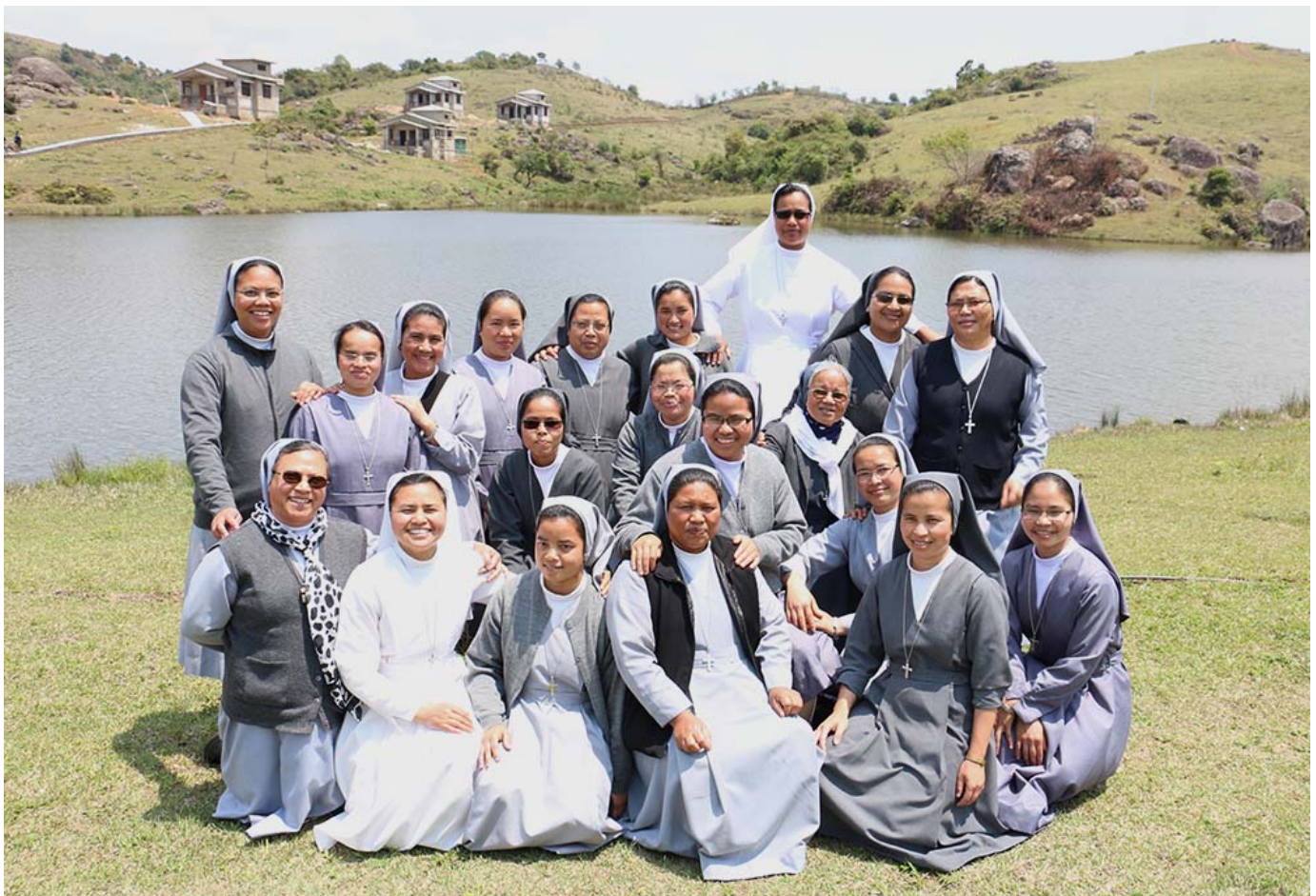
A group of our community sisters on an Easter outing on April 22, 2019, share the joy of being together.

I feel that community and mission are two sides of the same coin. When religious live the aim of community living — namely, contemplation of God and the pursuit of Christian perfection — we cannot but go out to the world in service. God's love urges us to love our neighbor, too, and this is expressed by the variety of services (health care, education, prison ministry, evangelization, care for the aged and people with disabilities) that religious render to humankind, touching every aspect of human development.