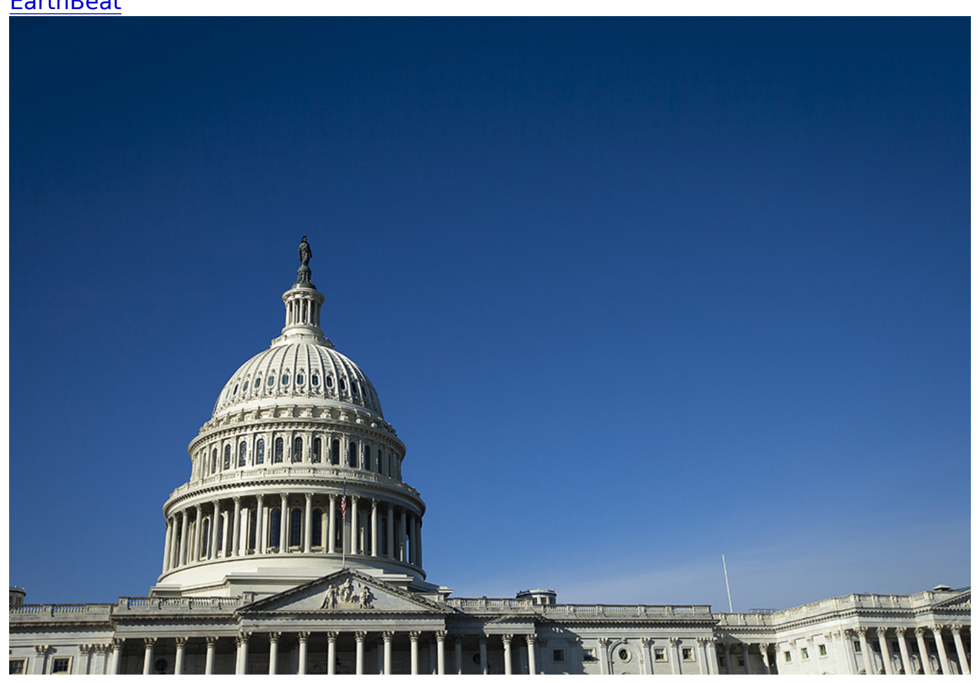
A view of the U.S. Capitol building in Washington.